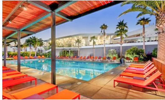
The Resort at Playa Vista