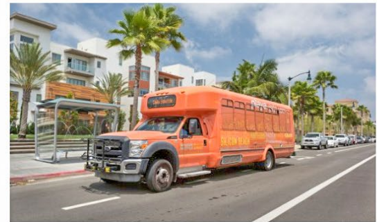
Playa Vista Daily with Beach Shuttles