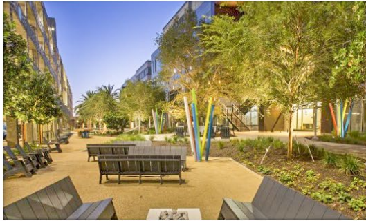
The Campus at Playa Vista