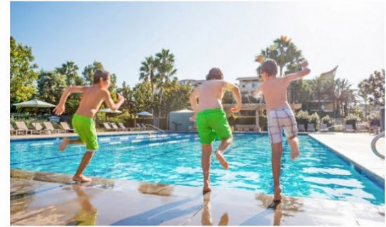
The Centerpointe Club