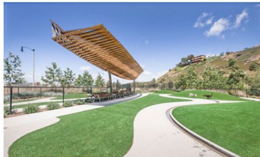
Bluff Creek Fields