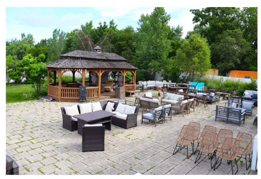
West Side of Building Court Yard