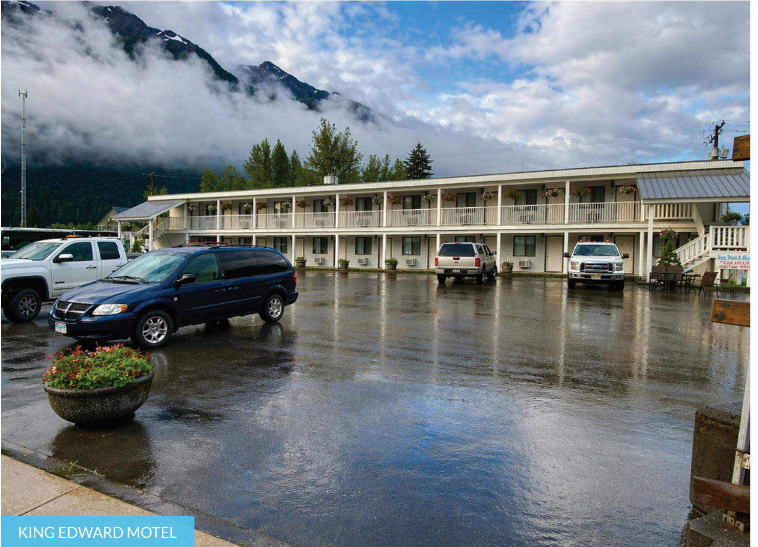
KING EDWARD MOTEL