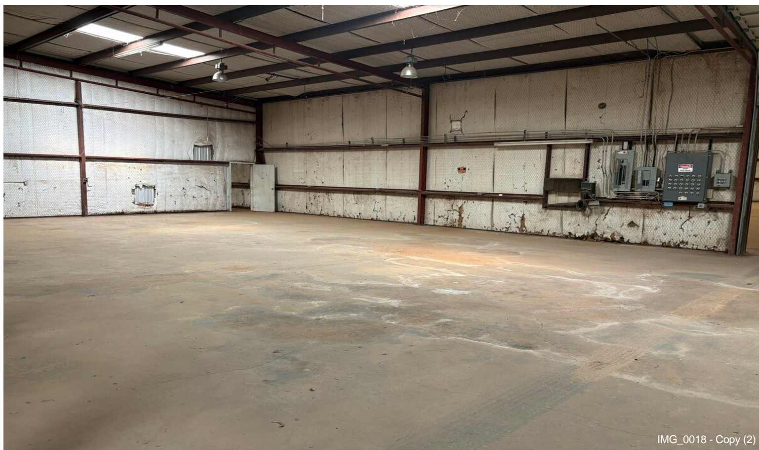
IMG_0018 - Copy (2)