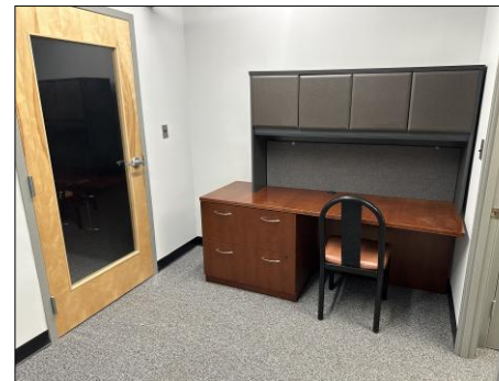
Rear Open Work Area