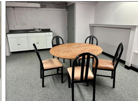
Open Area / Break Room / Kitchen

Although all information furnished is from sources we deem reliable, such information has not been verified and no express representation is made, nor is any to be implied, as to the accuracy thereof, and it is submitted subject to errors, omissions, changes of price/rental or other conditions prior to sale or lease, and subject to withdrawal without notice.