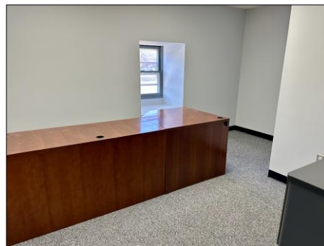
Front Right Windowed Office