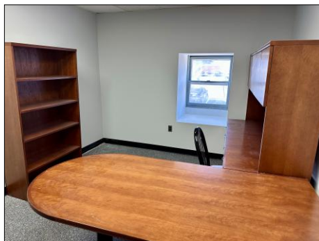
Front Left Windowed Office