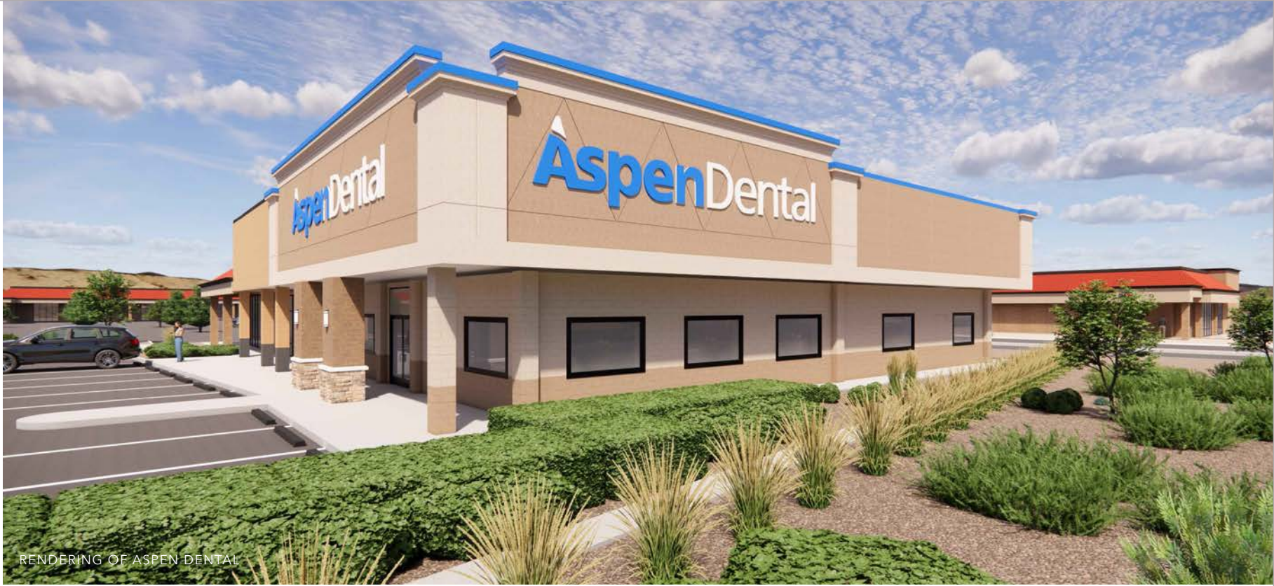
RENDERING OF ASPEN DENTAL