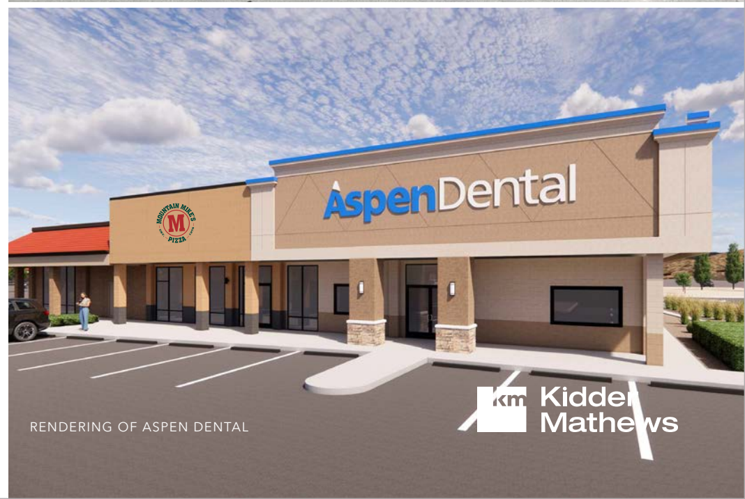
RENDERING OF ASPEN DENTAL