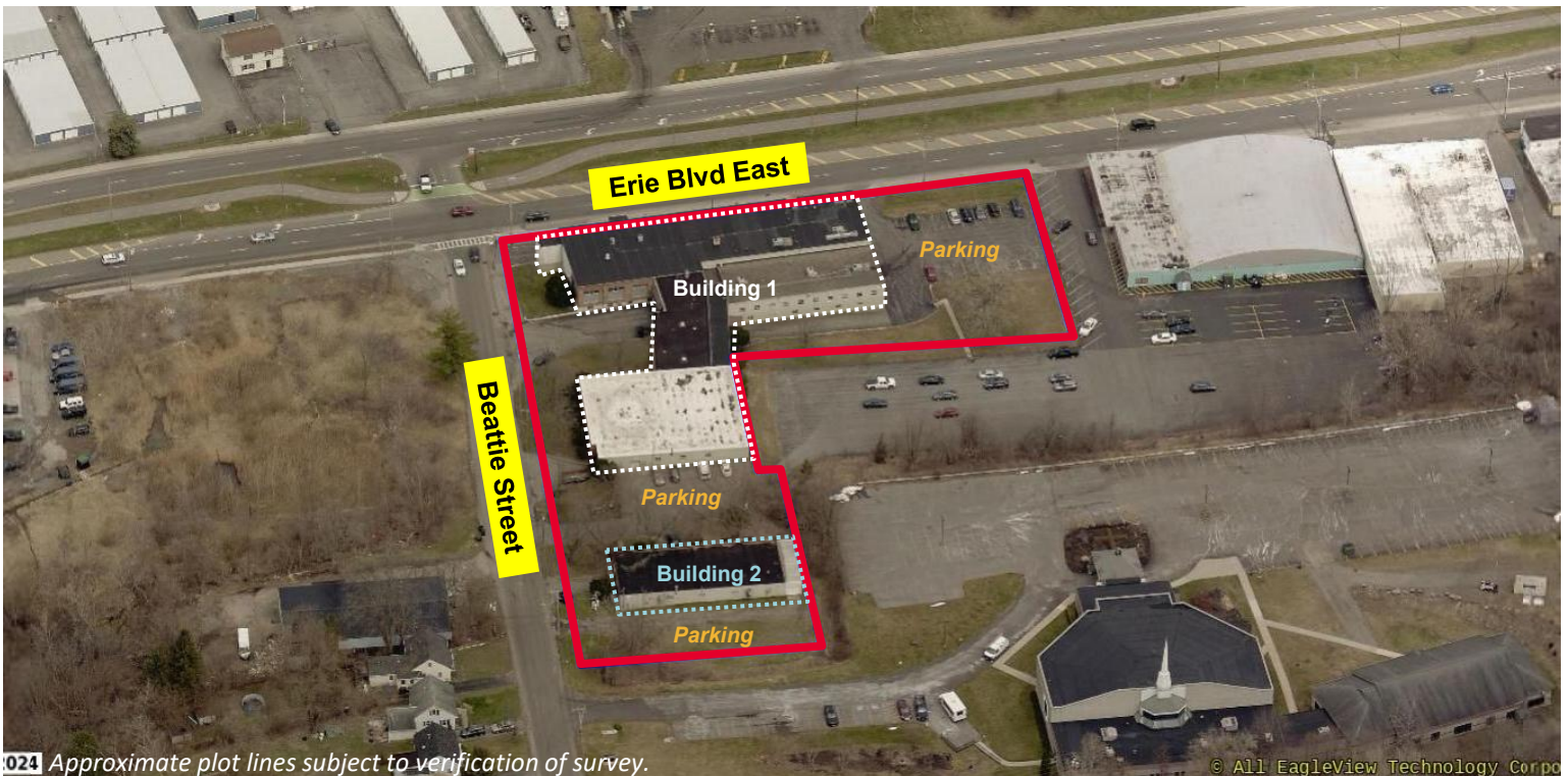
2024 Approximate plot lines subject to verification of survey.