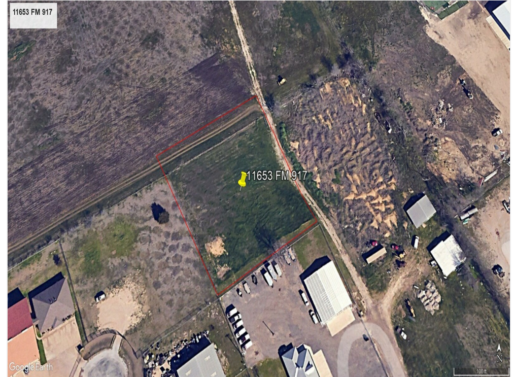
11653 FM 917 Aerial - Close