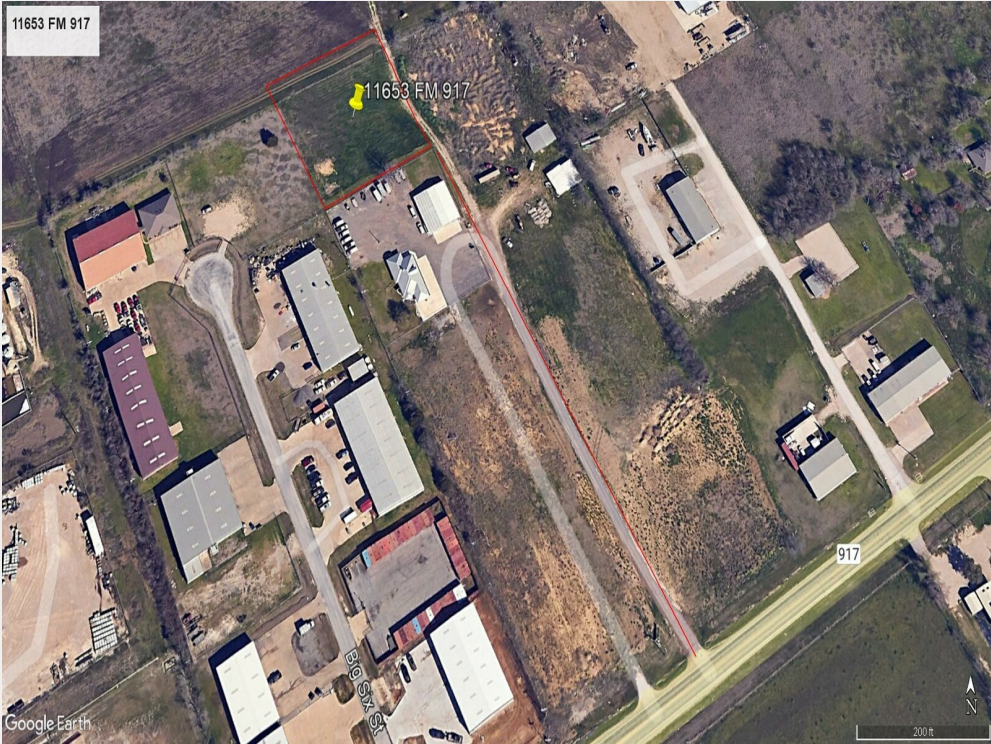
11653 FM 917 Aerial - Access Easement