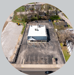
IDEAL LOCATION ON HIGH MAIN STREET