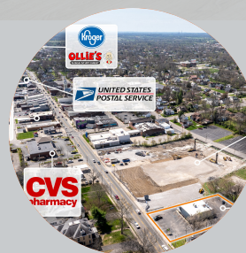
LOCAL RETAIL SURROUNDING