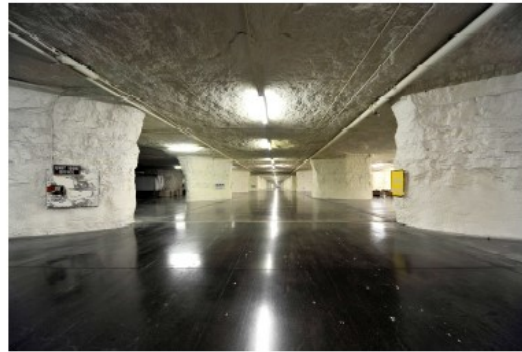
Roadway to Buildings