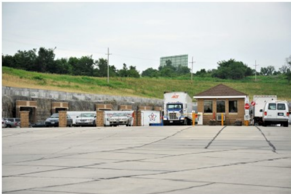
24/7 Guard Station