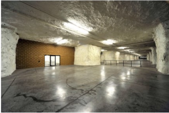
Entrance to Demised Building