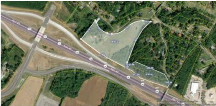
0 Pleasant Grove Rd SW, 3139 Pleasant Grove, aerial, acre, dist