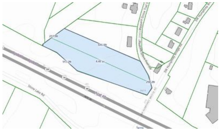
0 Pleasant Grove Rd SW, topo, acre, dist, mid