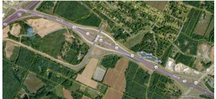
0 Pleasant Grove Rd SW, aerial, acre, dist, far