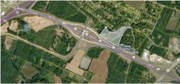
0 Pleasant Grove Rd SW, 3139 Pleasant Grove, aerial, acre, dist, far