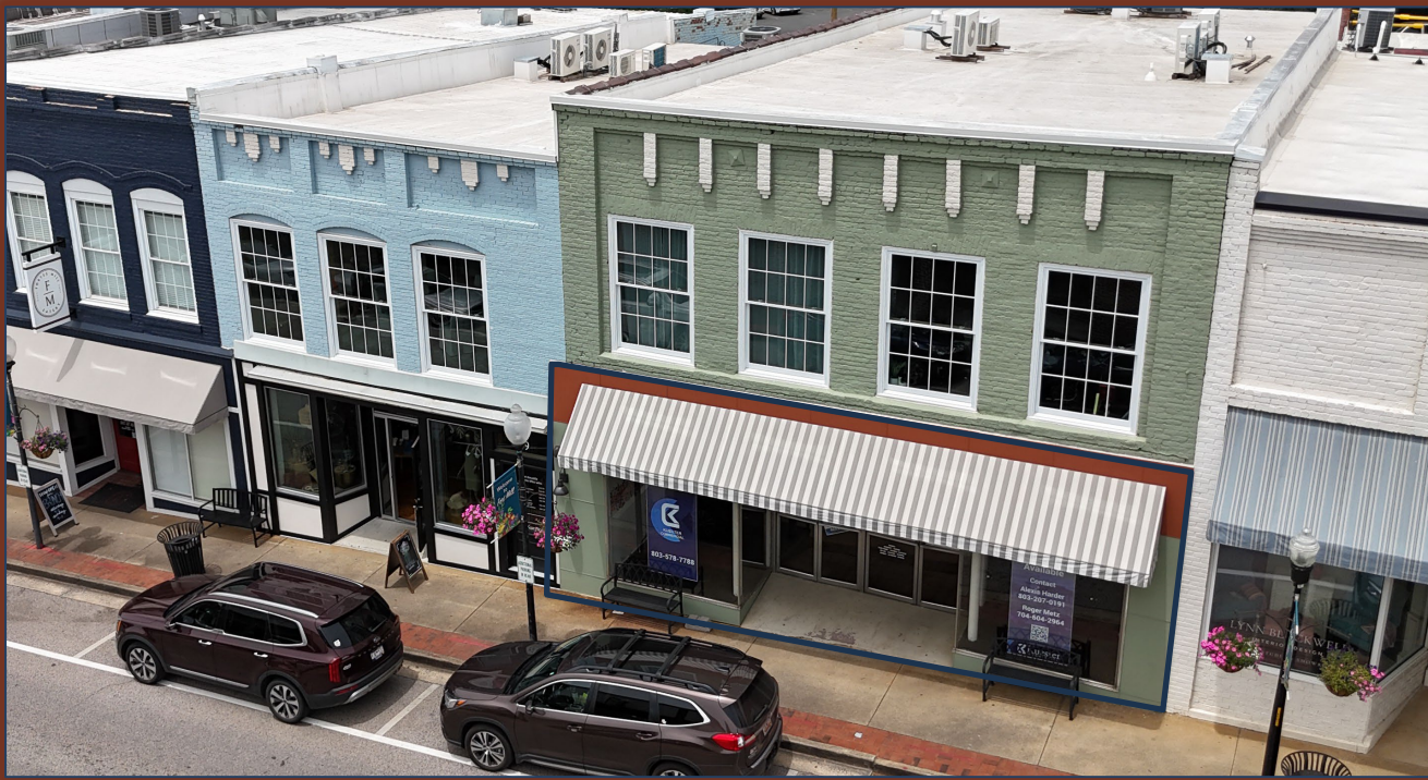
Downtown Fort Mill

TRAFFIC COUNT: 9,600 AADT Route ID: SC-160 Main Line