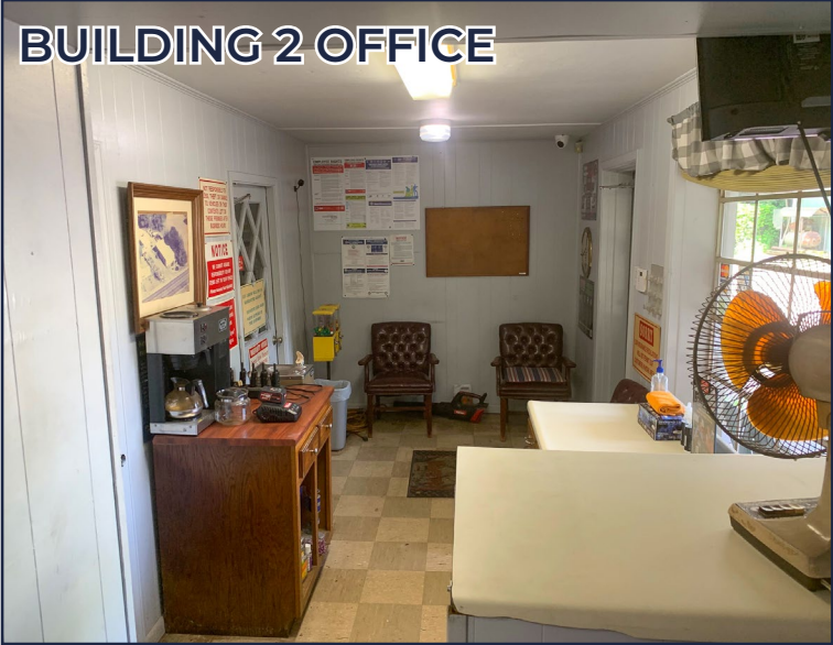
BUILDING 2 OFFICE