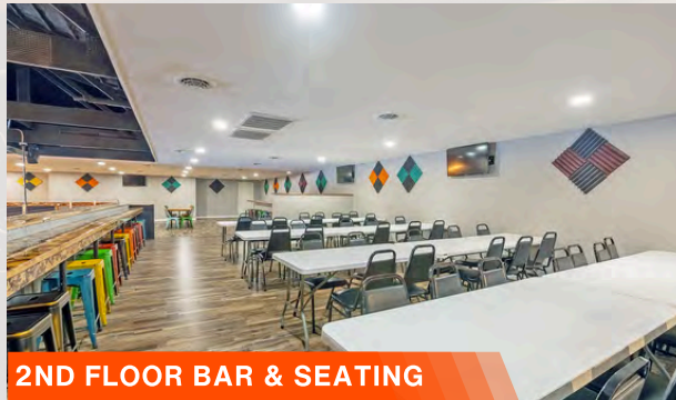
2ND FLOOR BAR & SEATING