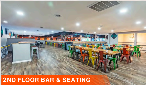
2ND FLOOR BAR & SEATING