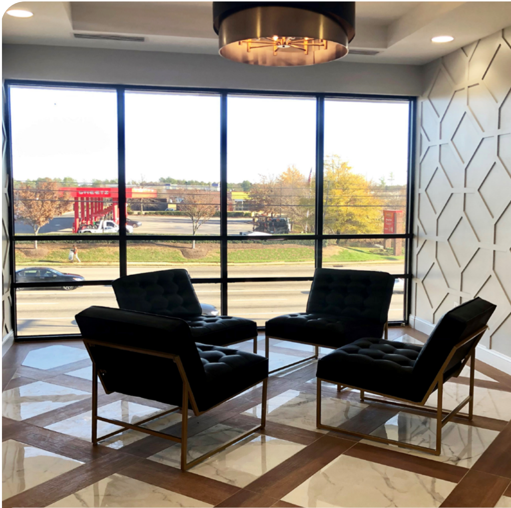
2ND FLOOR LOBBY

Brian Farmer, SIOR bfarmer@lee-associates.com D 919-576-2503 C 919-730-6584