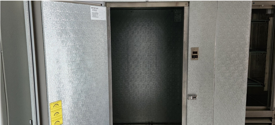
Suite H - Walk - in freezer

Curtis Barlow 760 899 7700 CalDRE #01380247