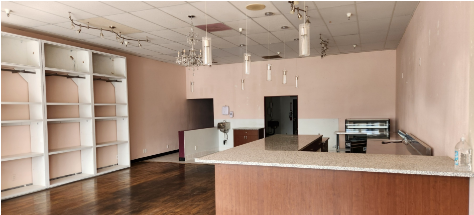
Suite H - Oblique view of sales area