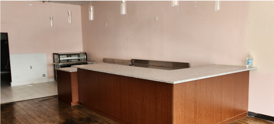
Suite H - Service Counter