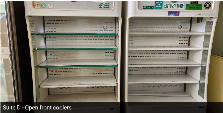
Suite D - Open front coolers