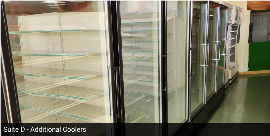
Suite D - Additional Coolers