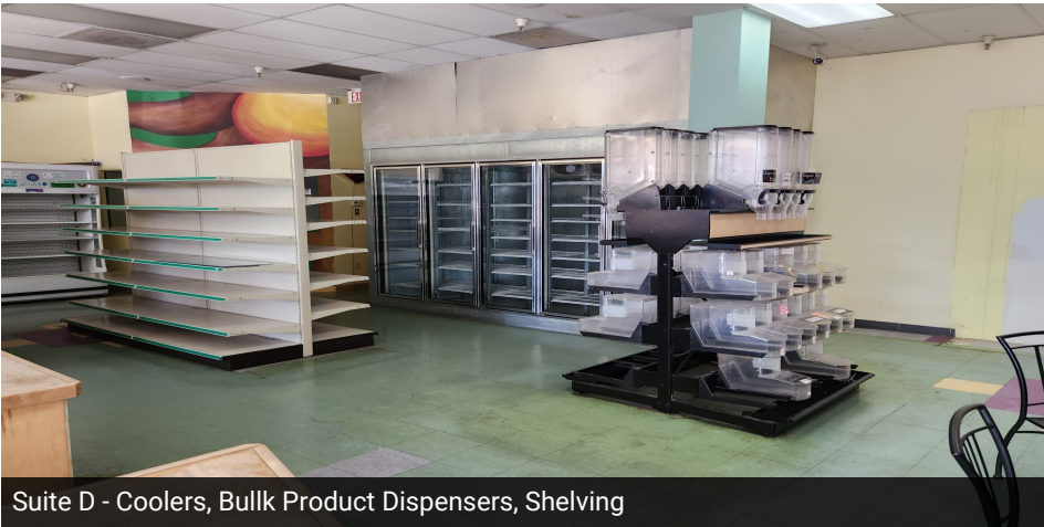
Suite D - Coolers, Bulk Product Dispensers, Shelving

Curtis Barlow 760 899 7700 CaIDRE #01380247