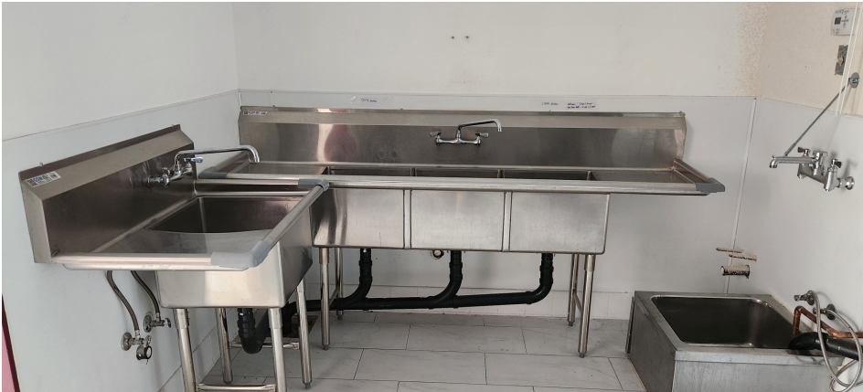
Suite H - Stainless steel sinks