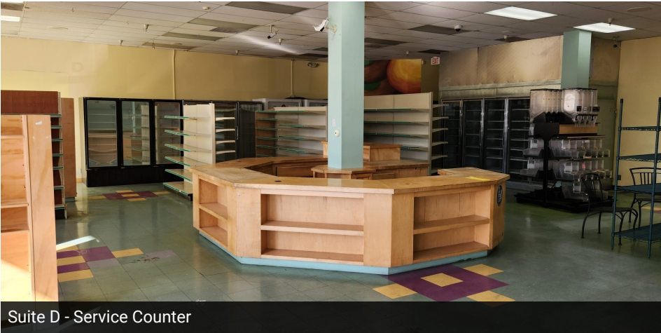
Suite D - Service Counter