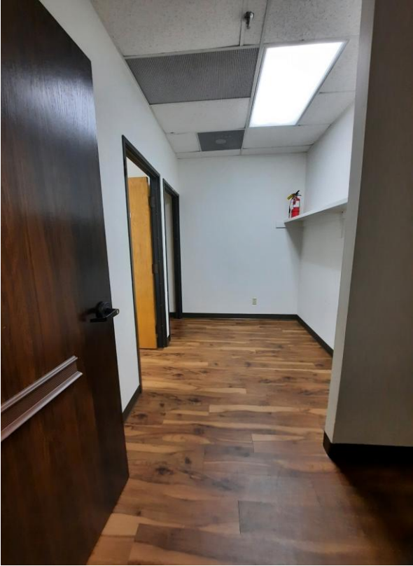
Suite 206 – 530 sf