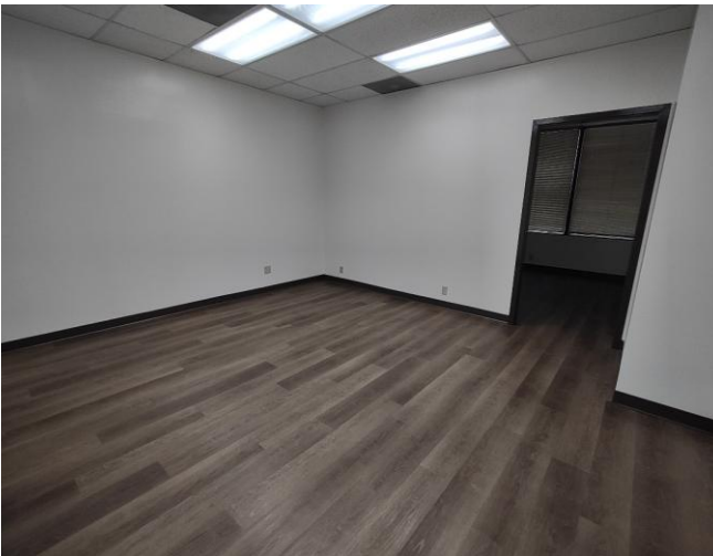
Suite 520 – 540sf