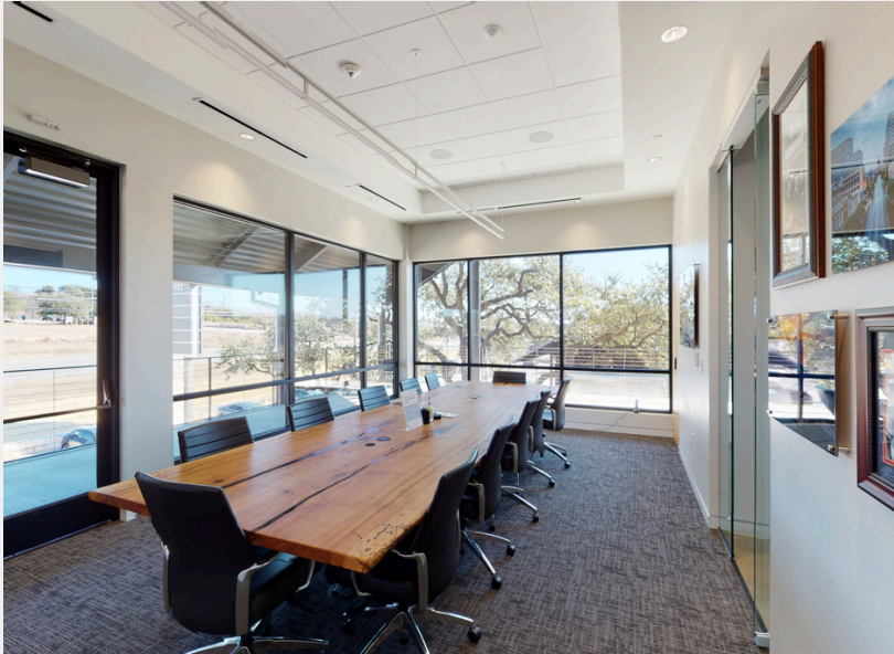
Pecan Conference Room