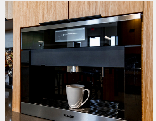
Miele Espresso Machine

We keep our kitchen fully stocked with a variety of healthy drink and snack options, including but not limited to: