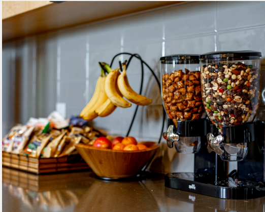
Health Snacks & Fresh Fruit