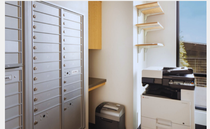
Mail & Printer Room