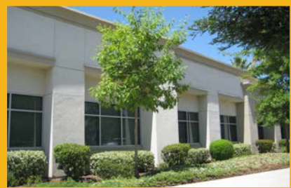
4927 Calloway Drive