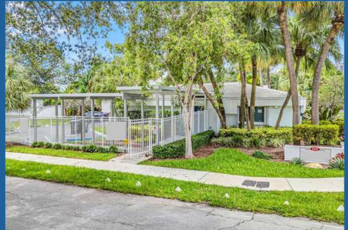
115 includes 2 of the Lots and one is a Corner