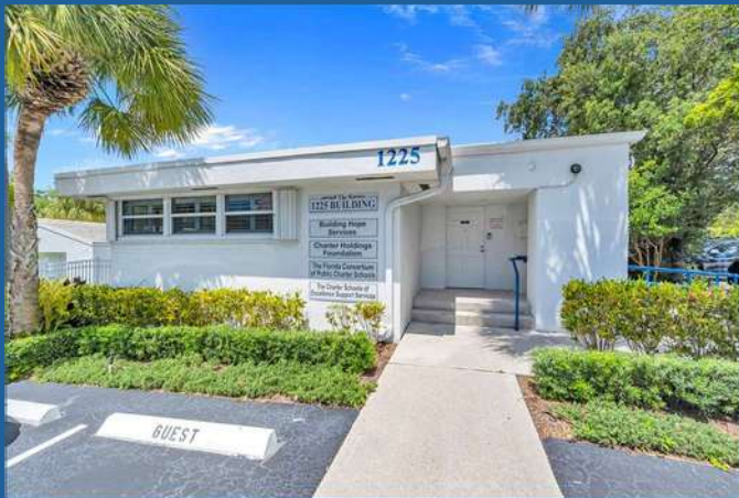
Both of these properties sit on a ½ Acre site