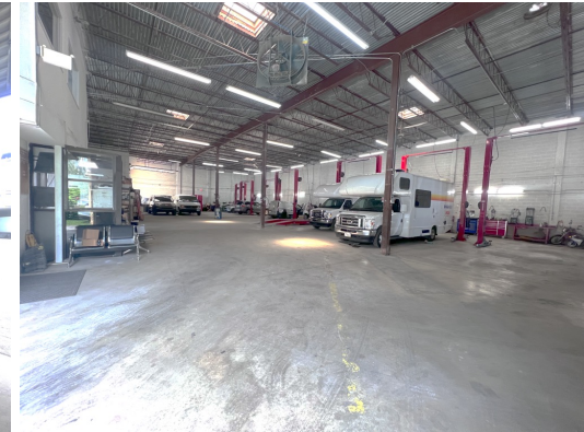
Warehouse area: 2 Drive In Doors / 1 Dock Well / 21' Ceiling Height