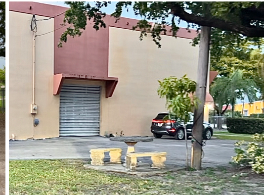
Exterior area: 16,898 SF Corner Lot / Fenced in yard / Parking / Outdoor Lounge Area