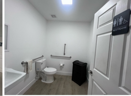
1st level office area: Reception / Glass Office Facing Warehouse Area / Break Room / 2 restrooms