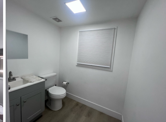
2nd level office area: 2 Offices / restrooms / IT Closet