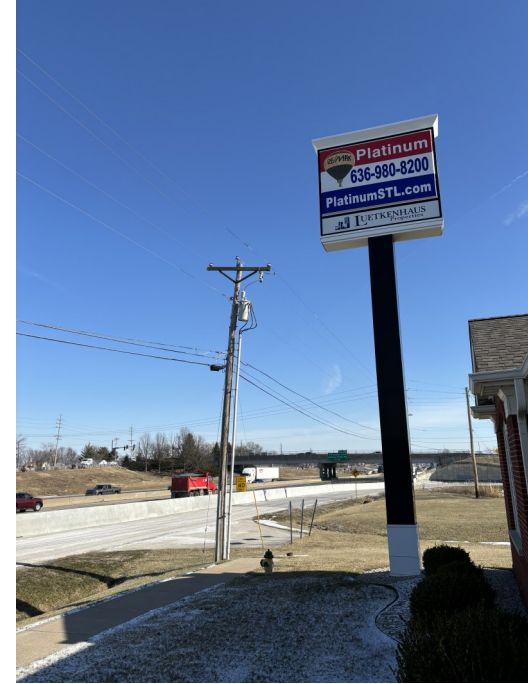
View of Signage in Proximity to I-70

Jared Stone, Associate 314-604-8466 / jstone@ccr-stl.com