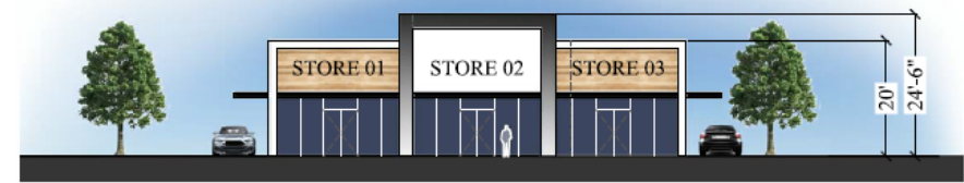
Option #2 - TRIO