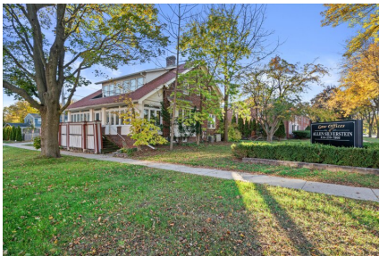
View from Swan and North Ave