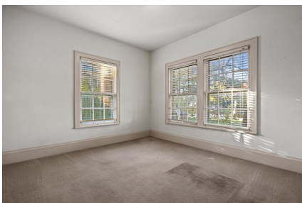
Office or conference room