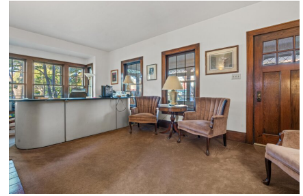
Large reception area