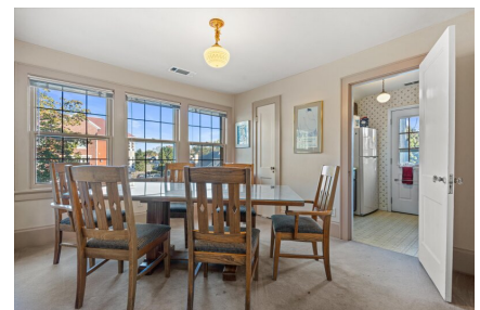
Conference room off kitchen