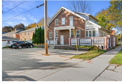
5 car parking