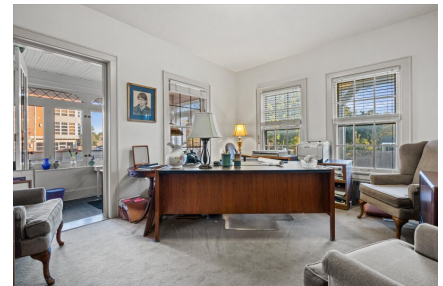
Main floor office