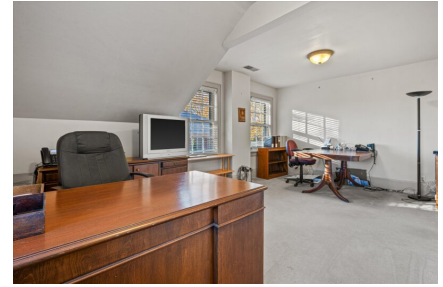
Upper level office