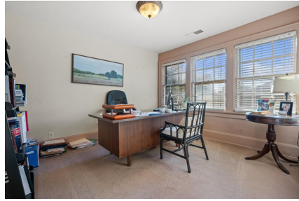
Upper level office