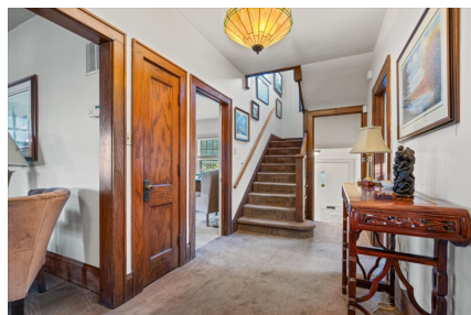
Main floor hallway