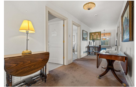
Upper level hallway