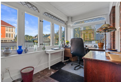
Mn flppr office enclosed porch