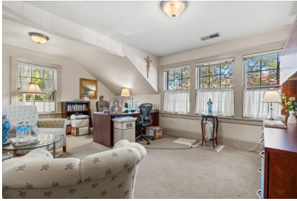
Upper level office

2281 N Swan Blvd, Wauwatosa, WI 53226-2652