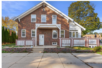
Entry from parking lot