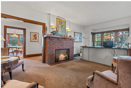
Reception area view 2