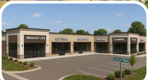
Possible Development Renderings

Development Lot Across from Hy-Vee/Central Park Commons Shopping Center