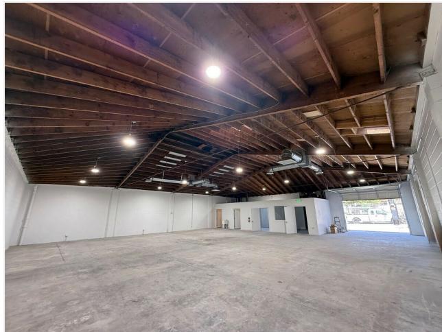
Interior view of building 3605