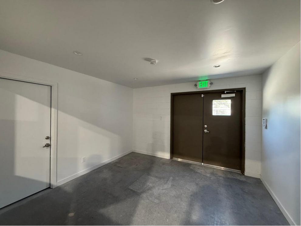
Steel double doors