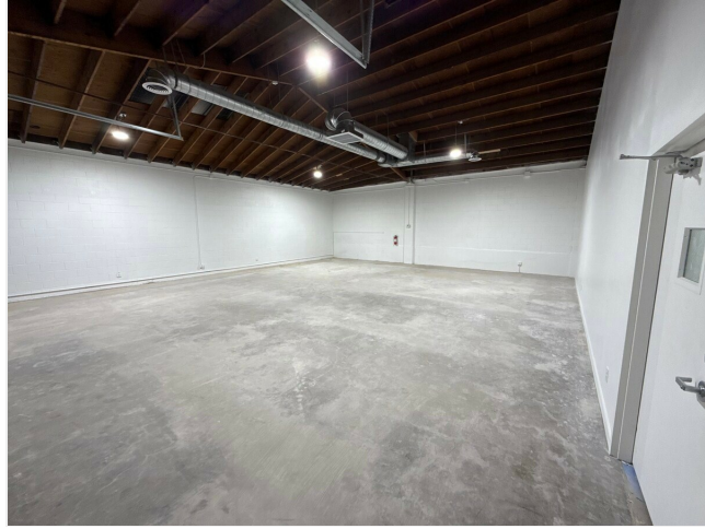
Interior view of conjoined building

3601-3605 E 8th St, Los Angeles, CA 90023