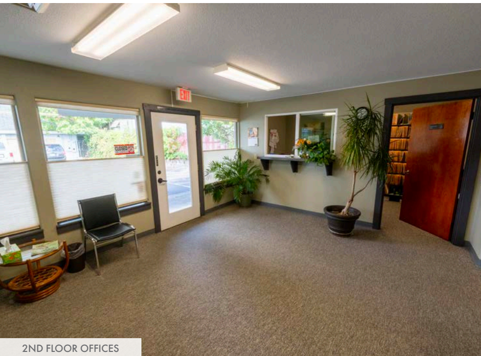
2ND FLOOR OFFICES