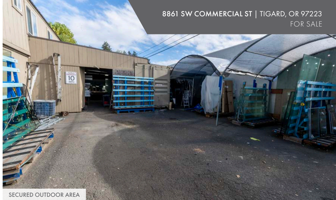
SECURED OUTDOOR AREA