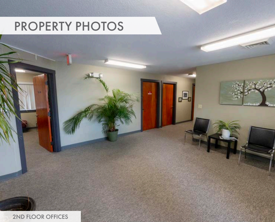
2ND FLOOR OFFICES