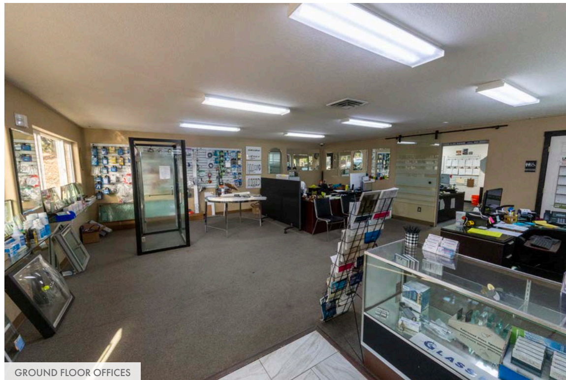
GROUND FLOOR OFFICES

8861 SW COMMERCIAL ST | TIGARD, OR 97223 FOR SALE