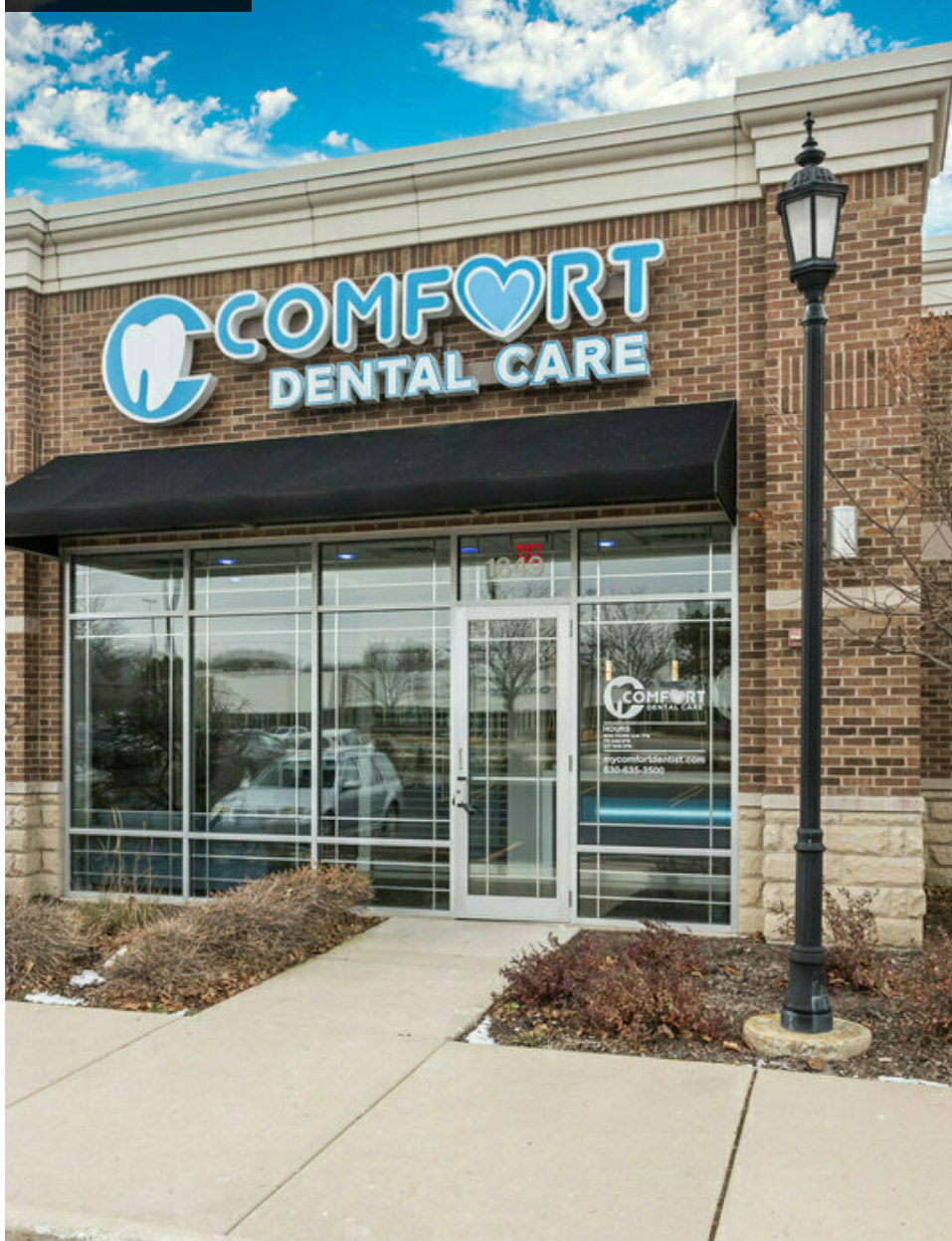
Suite 107 - Exterior