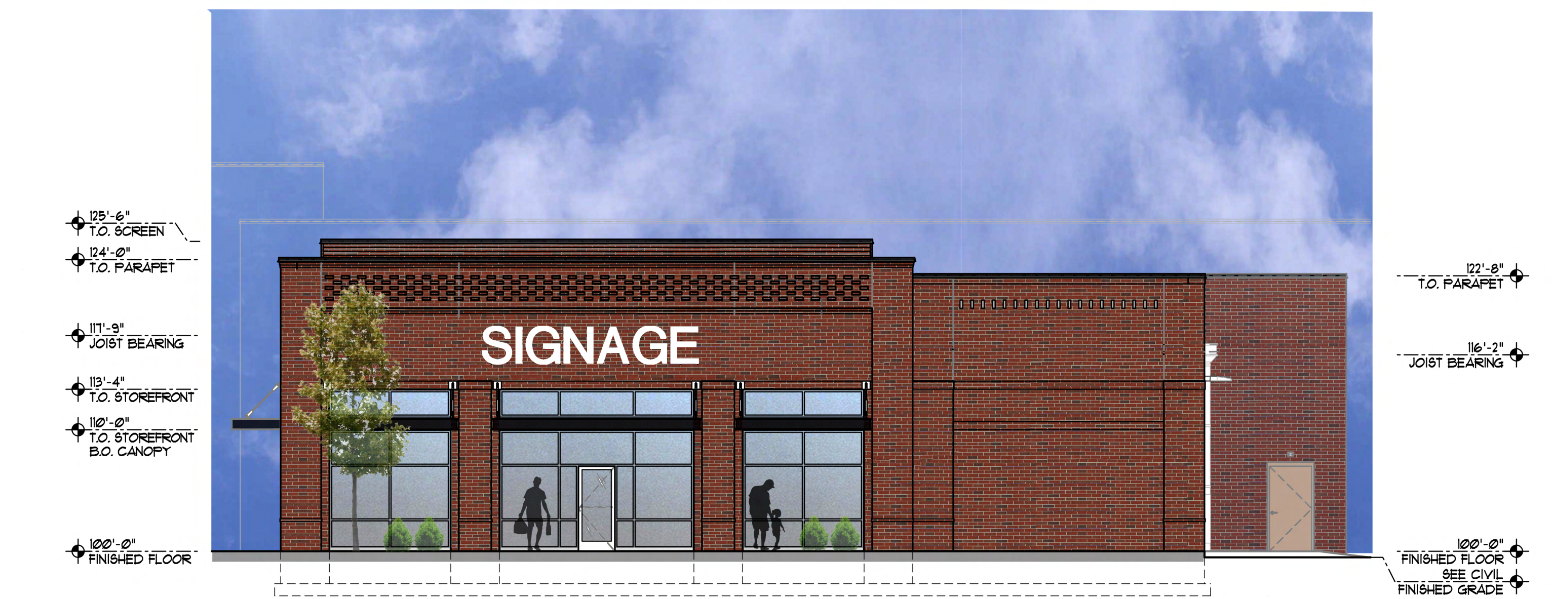
(D) WEST BUILDING ELEVATION SCALE 1/8" = 1'-0"