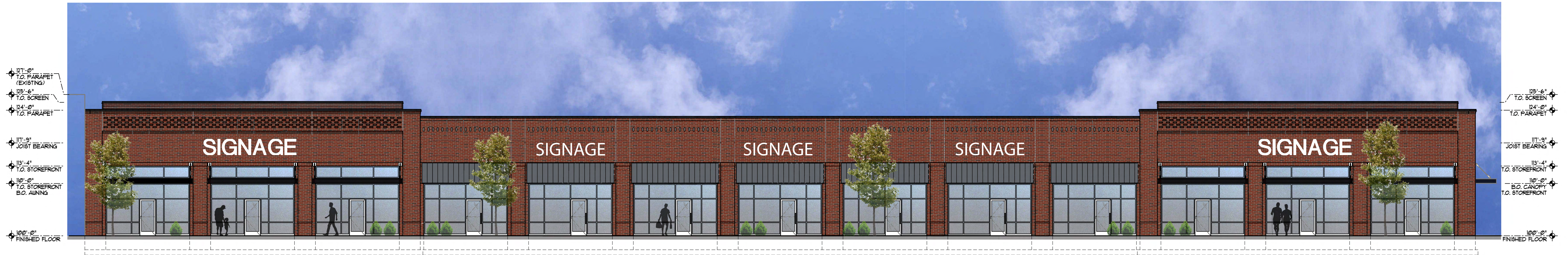
(B) NORTH BUILDING ELEVATION SCALE 1/8" = 1'-0"