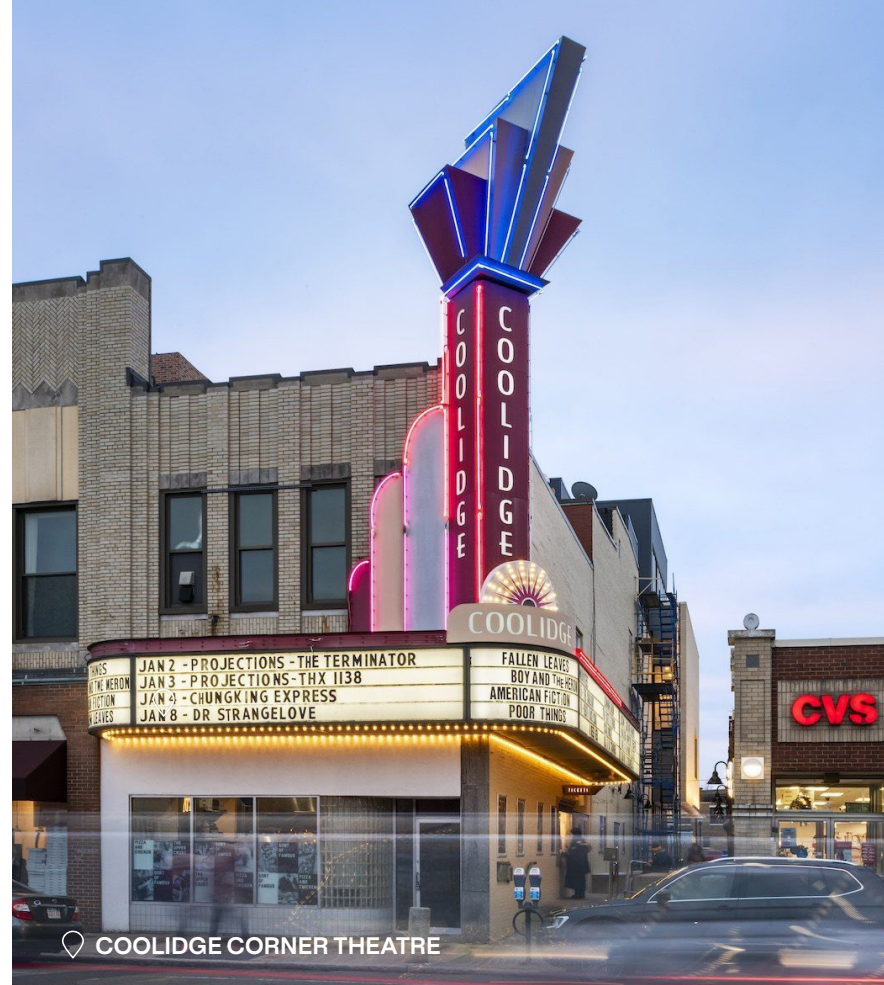
COOLIDGE CORNER THEATRE