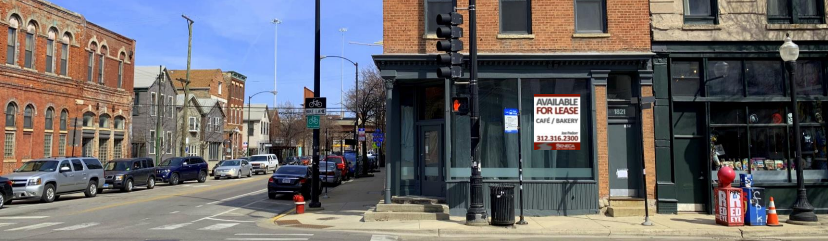
1821 S Halsted St., Chicago , Illinois