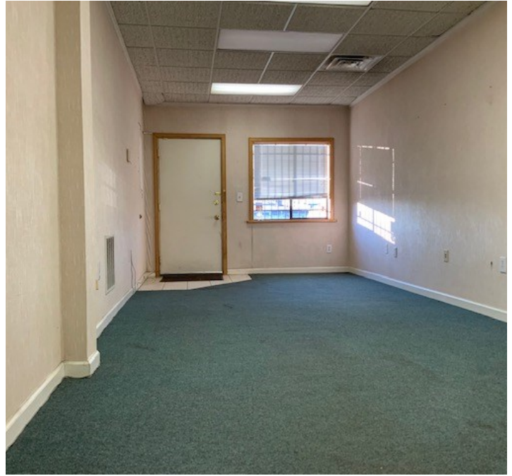
Office Entrance Area