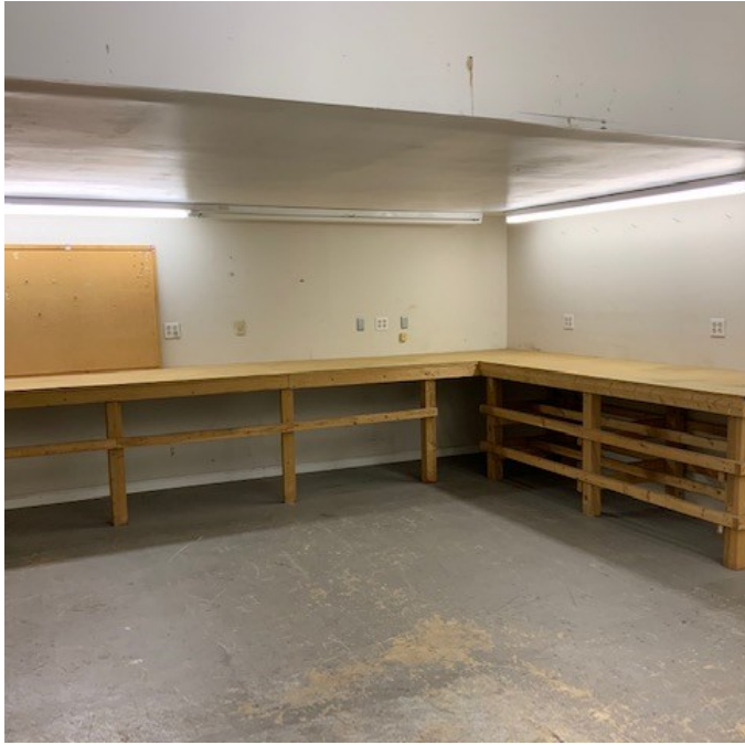
23 Linear Feet Work Bench Area

325 Robinson Lane Robinson Business Park Wilmington, DE 19805 (interior pictures)