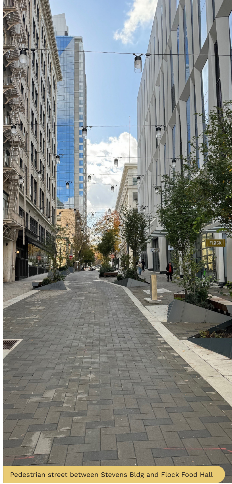
Pedestrian street between Stevens Bldg and Flock Food Hall