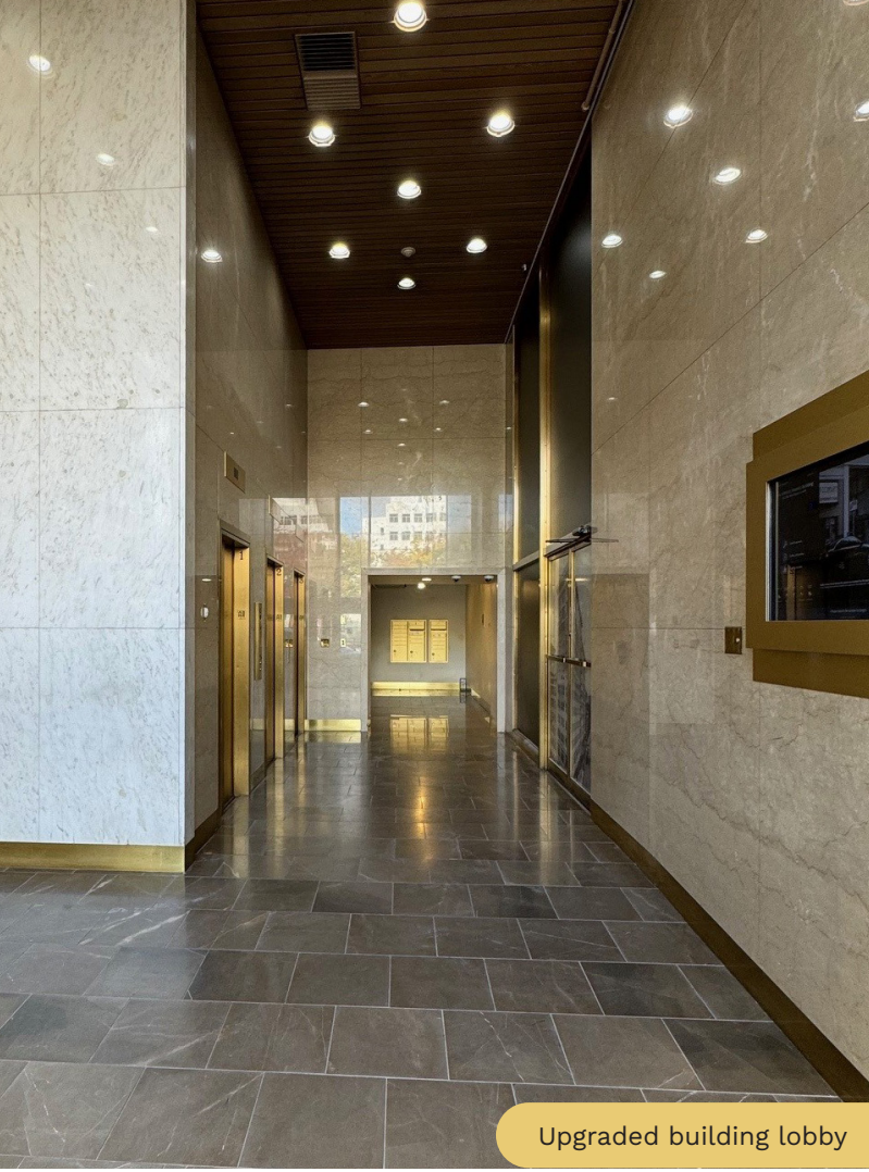
Upgraded building lobby