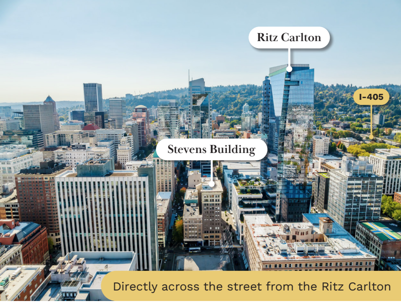
Directly across the street from the Ritz Carlton