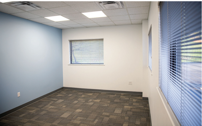
Suite 705: 4,700 SF