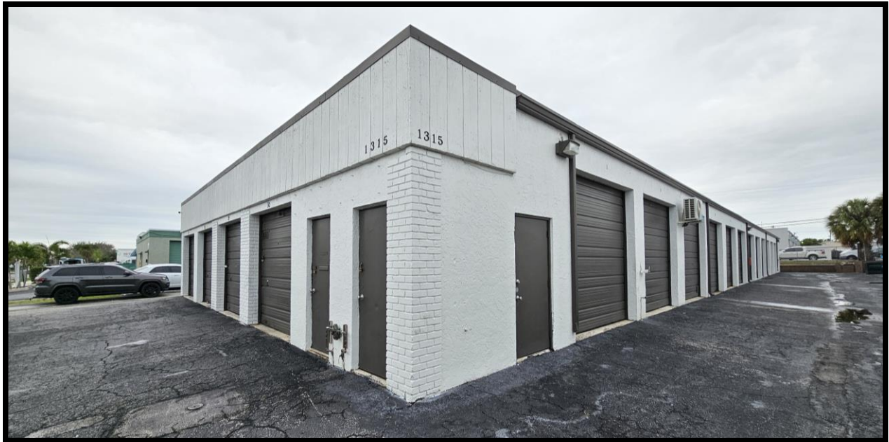
1315 SOUTH KILLIAN DRIVE, LAKE PARK, FLORIDA 33403