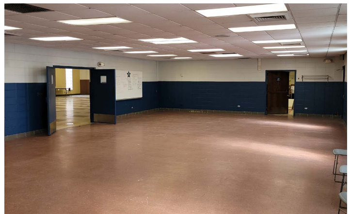
COMMUNITY FACILITY | MEETING ROOM