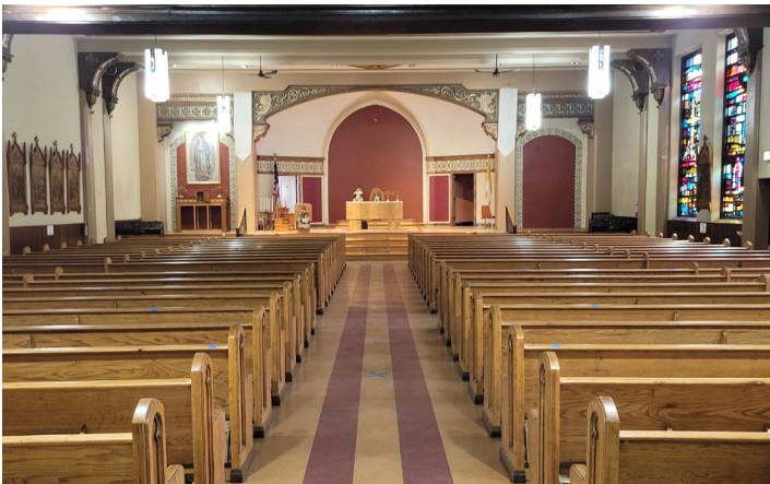
CHURCH BUILDING | SANCTUARY