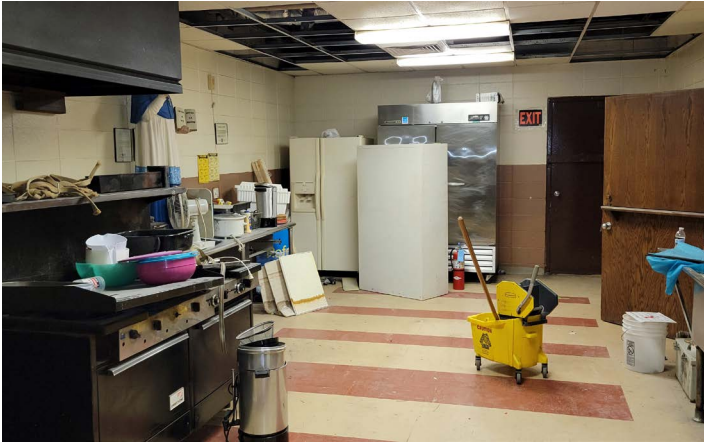
COMMUNITY FACILITY | KITCHEN