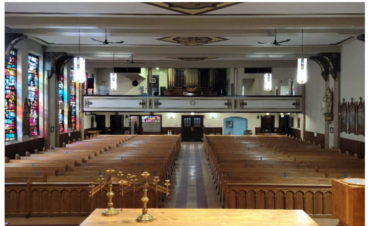
CHURCH BUILDING | SANCTUARY