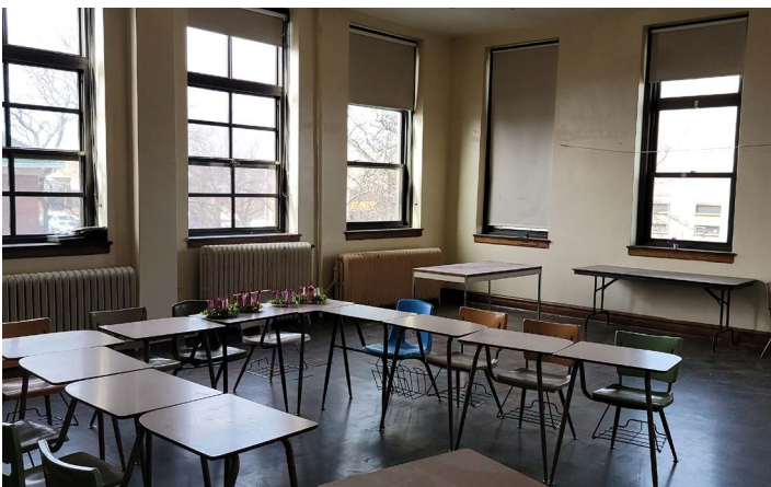
SCHOOL BUILDING | CLASSROOM