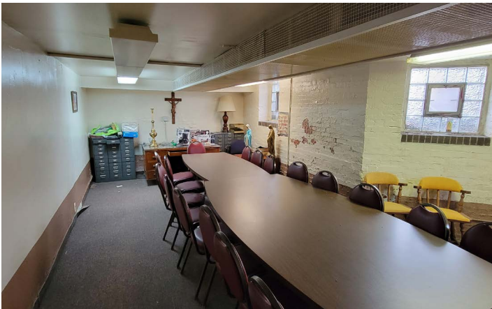
RECTORY | OFFICE