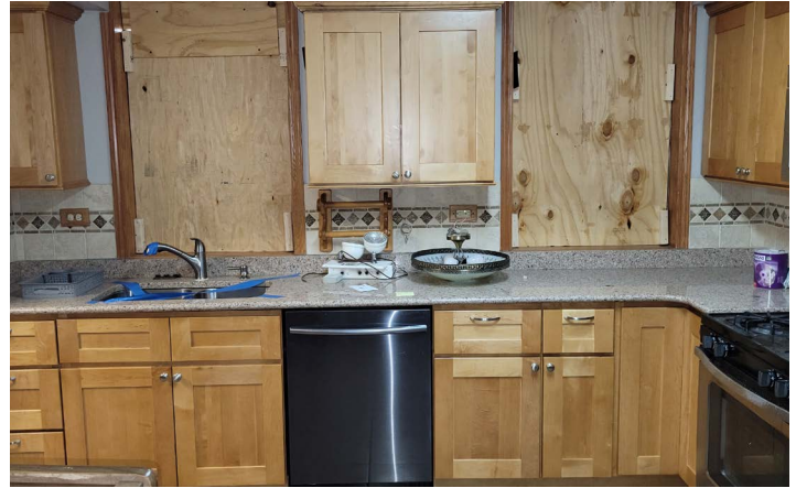
RECTORY | KITCHEN