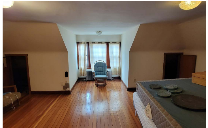
RECTORY | LIVING AREA