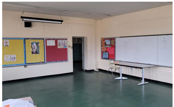
SCHOOL BUILDING | CLASSROOM