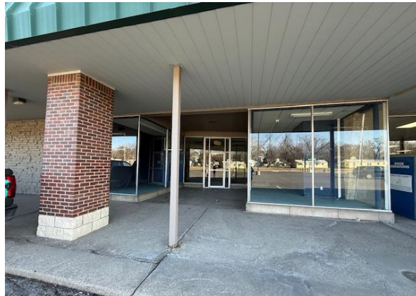
920 S. Oliver