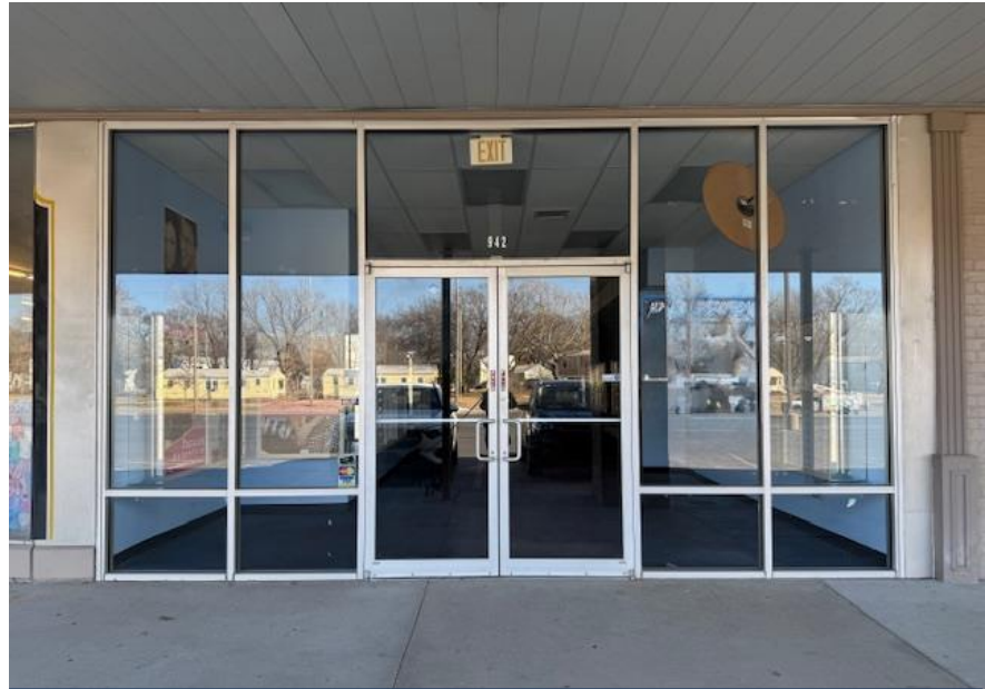
942 S. Oliver