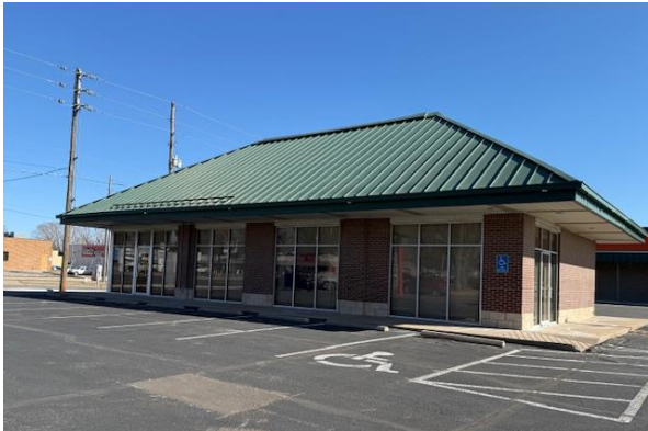
902 S. Oliver

SE/c of Lincoln and Oliver, Wichita, KS 67218