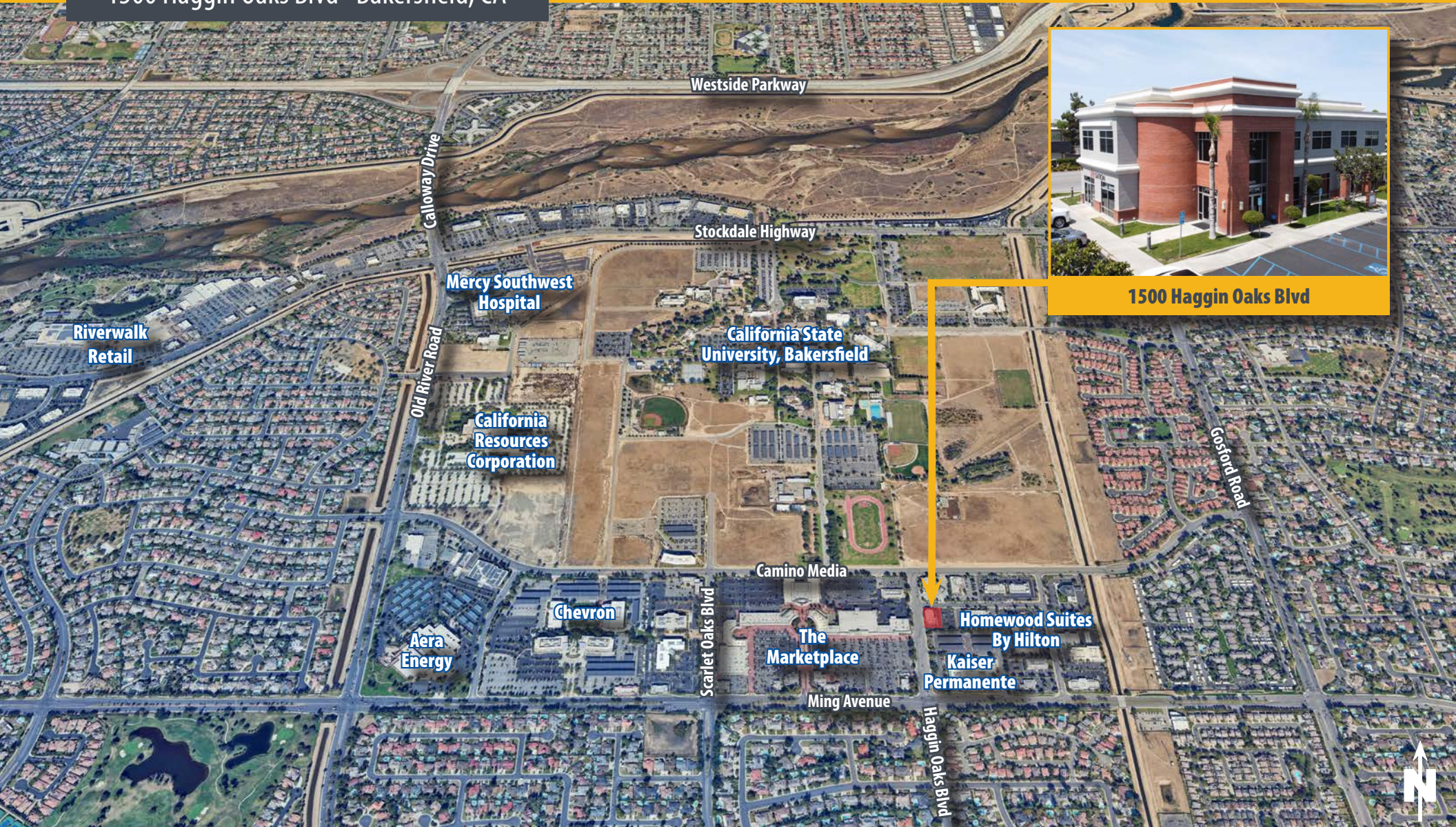
1500 Haggin Oaks Blvd