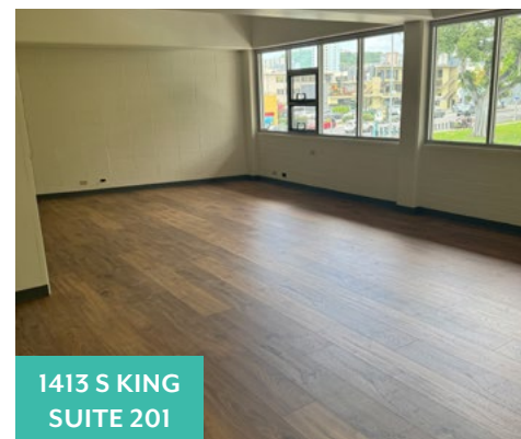
1413 S KING SUITE 201

This document/email has been prepared by Colliers for advertising and general information only. Colliers makes no guarantees, representations or warranties of any kind, expressed or implied, regarding the information including, but not limited to, warranties of content, accuracy and reliability. Any interested party should undertake their own inquiries as to the accuracy of the information. Colliers excludes unequivocally all inferred or implied terms, conditions and warranties arising out of this document and excludes all liability for loss and damages arising there from. This publication is the copyrighted property of Colliers and /or its licensor(s). © 2024. All rights reserved. This communication is not intended to cause or induce breach of an existing listing agreement.