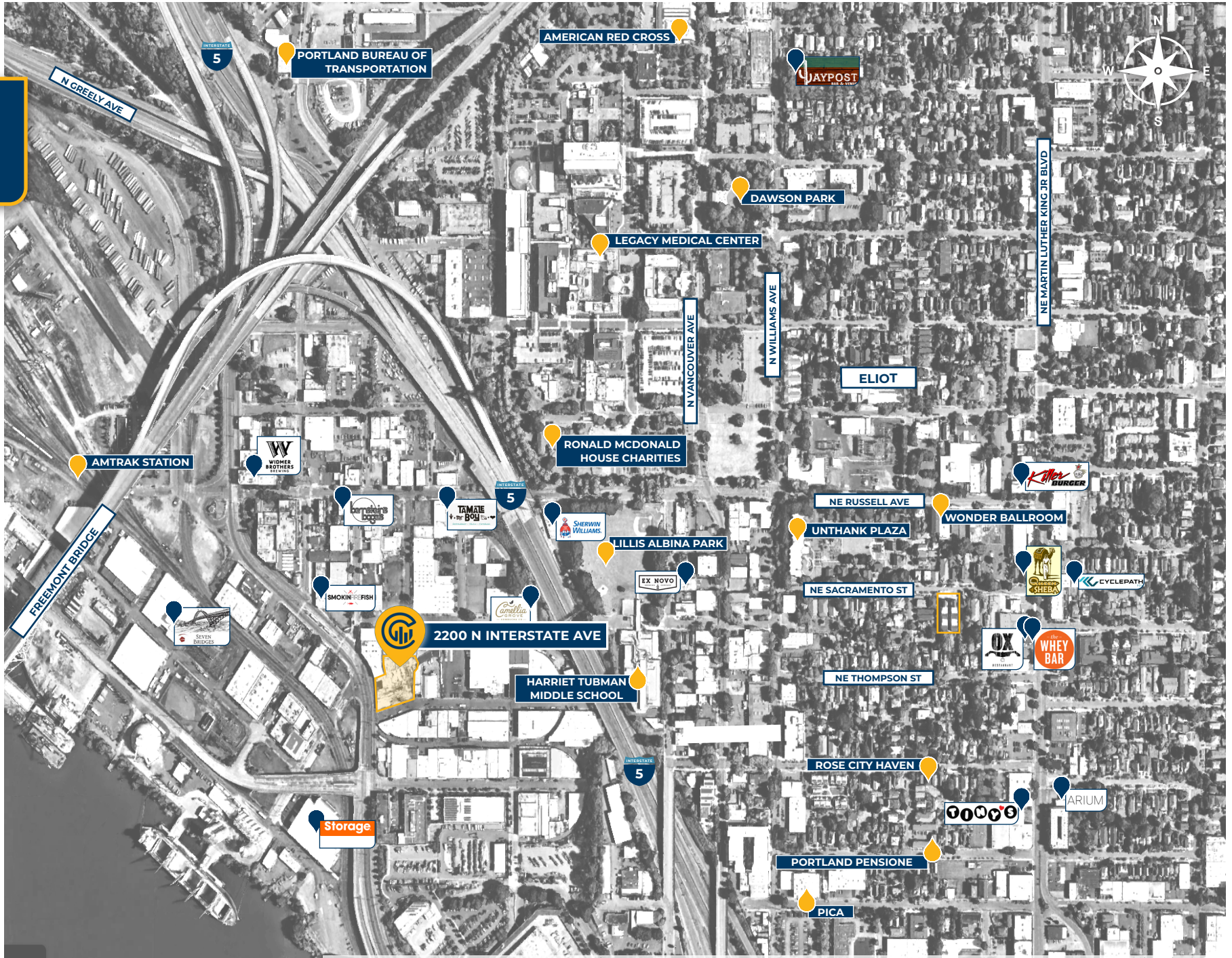
Map data ©2023 Google Imagery ©2023, Airbus, CNES / Airbus, Maxar Technologies, Metro, Portland Oregon, Public Laboratory, State of Oregon, U.S. Geological Survey, USDA/FPAC/CEO