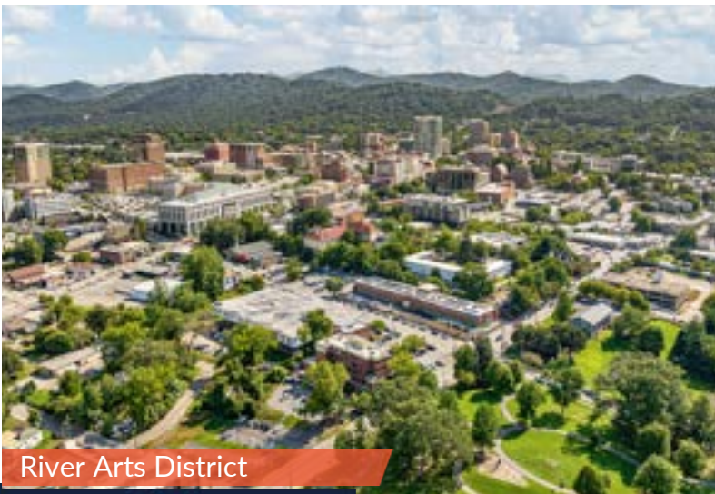
River Arts District