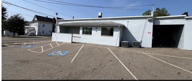
804 Amherst Rd NE