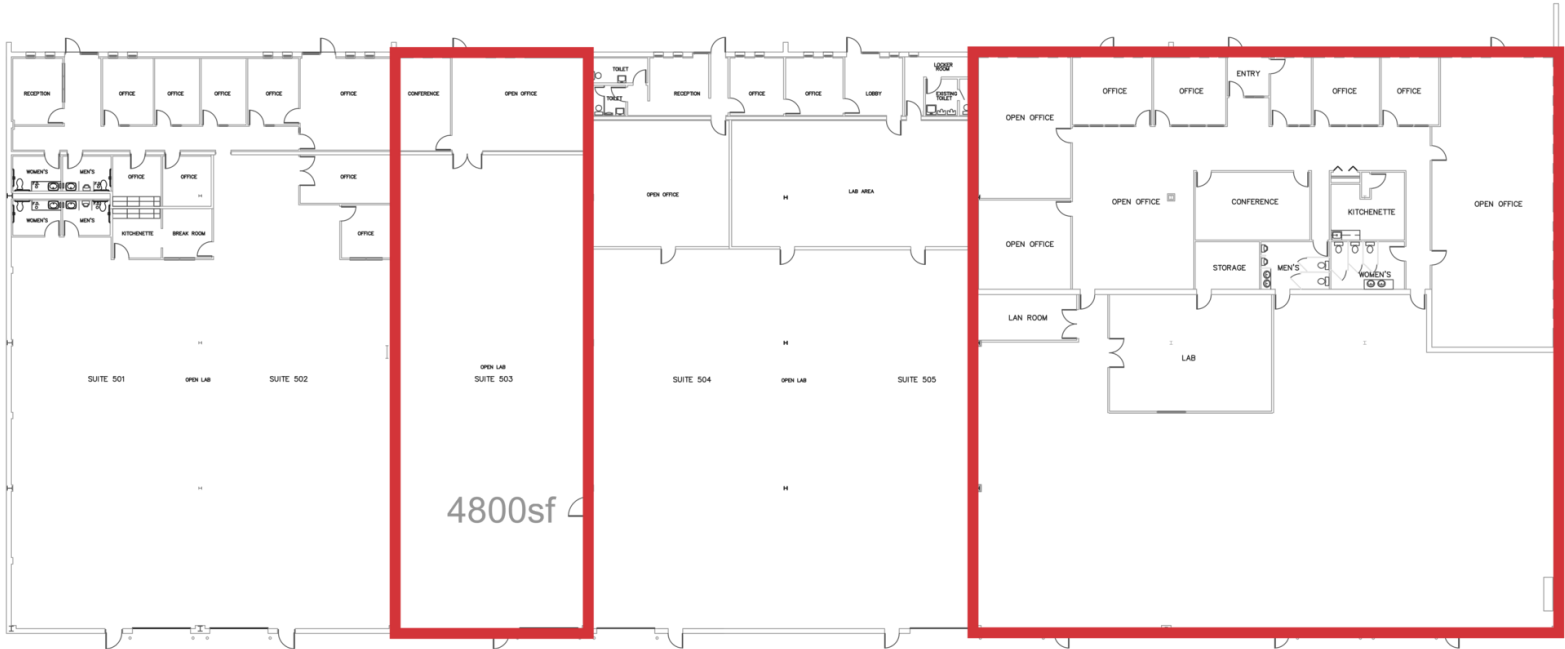
AS-BUILT FLOOR PLAN Scale: 1/8" = 1'-0" N