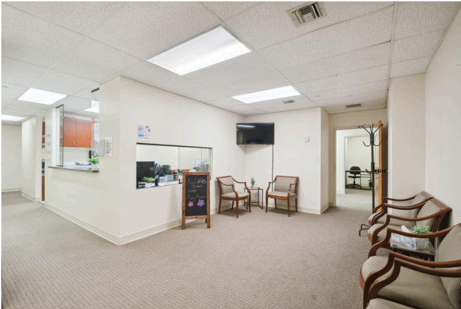
SUITE 330 - 3,426 RSF