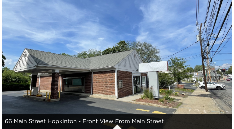
66 Main Street Hopkinton - Front View From Main Street