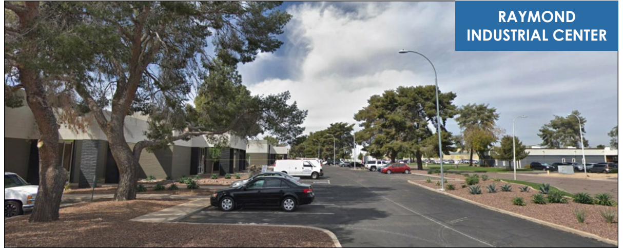
RAYMOND INDUSTRIAL CENTER