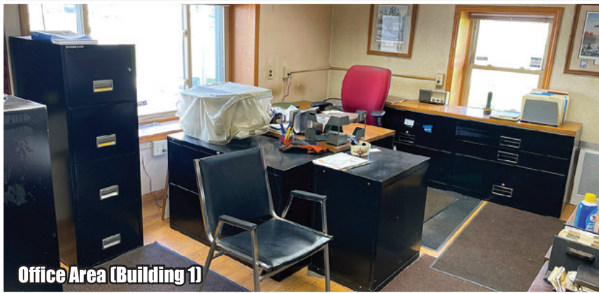
Office Area (Building 1)