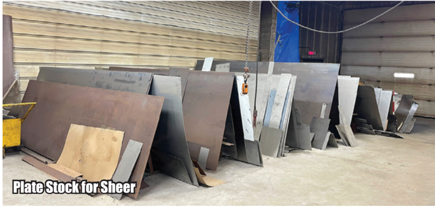
Plate Stock for Sheer