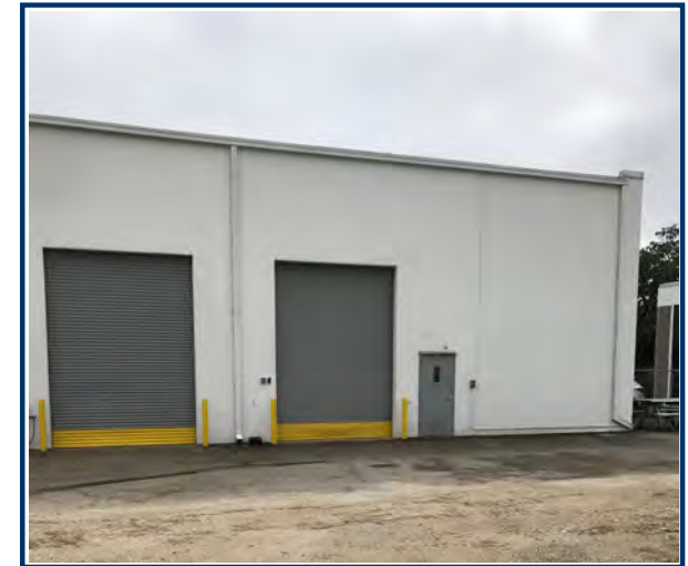
Grade Level Doors to Warehouse