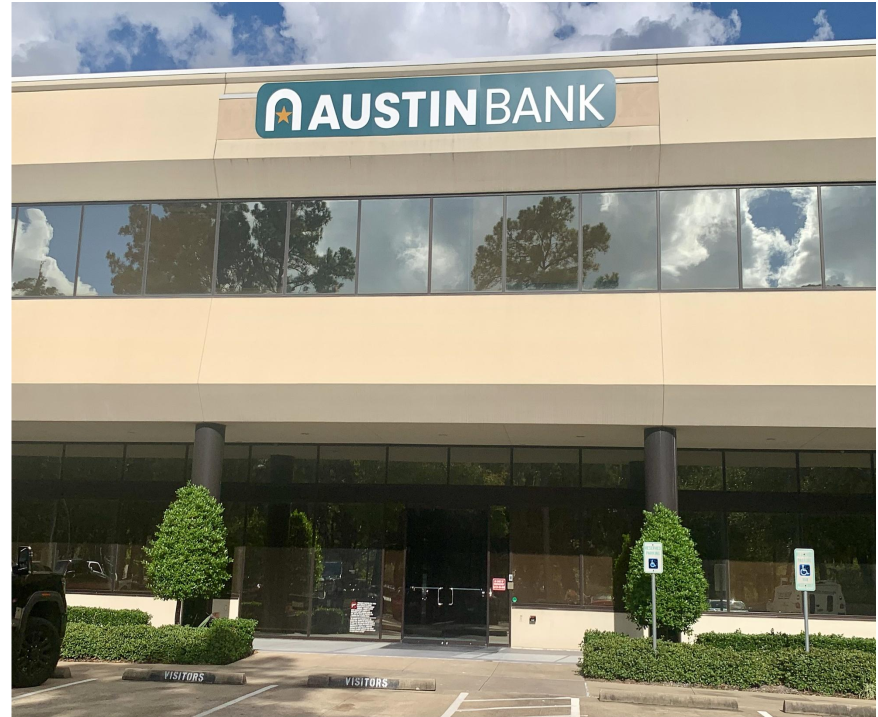
Austin Bank Building • 8500 Cypresswood Drive