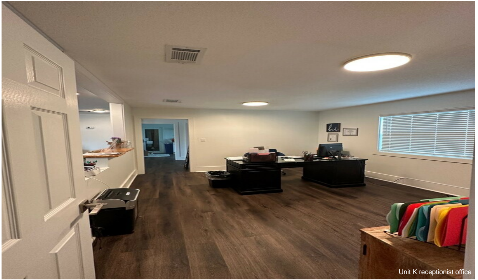
Unit K receptionist office