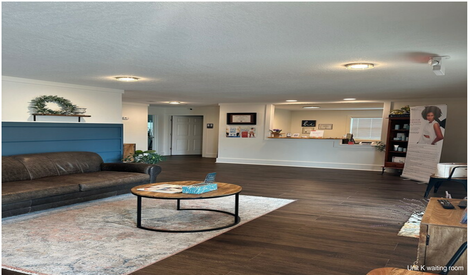
Unit K waiting room