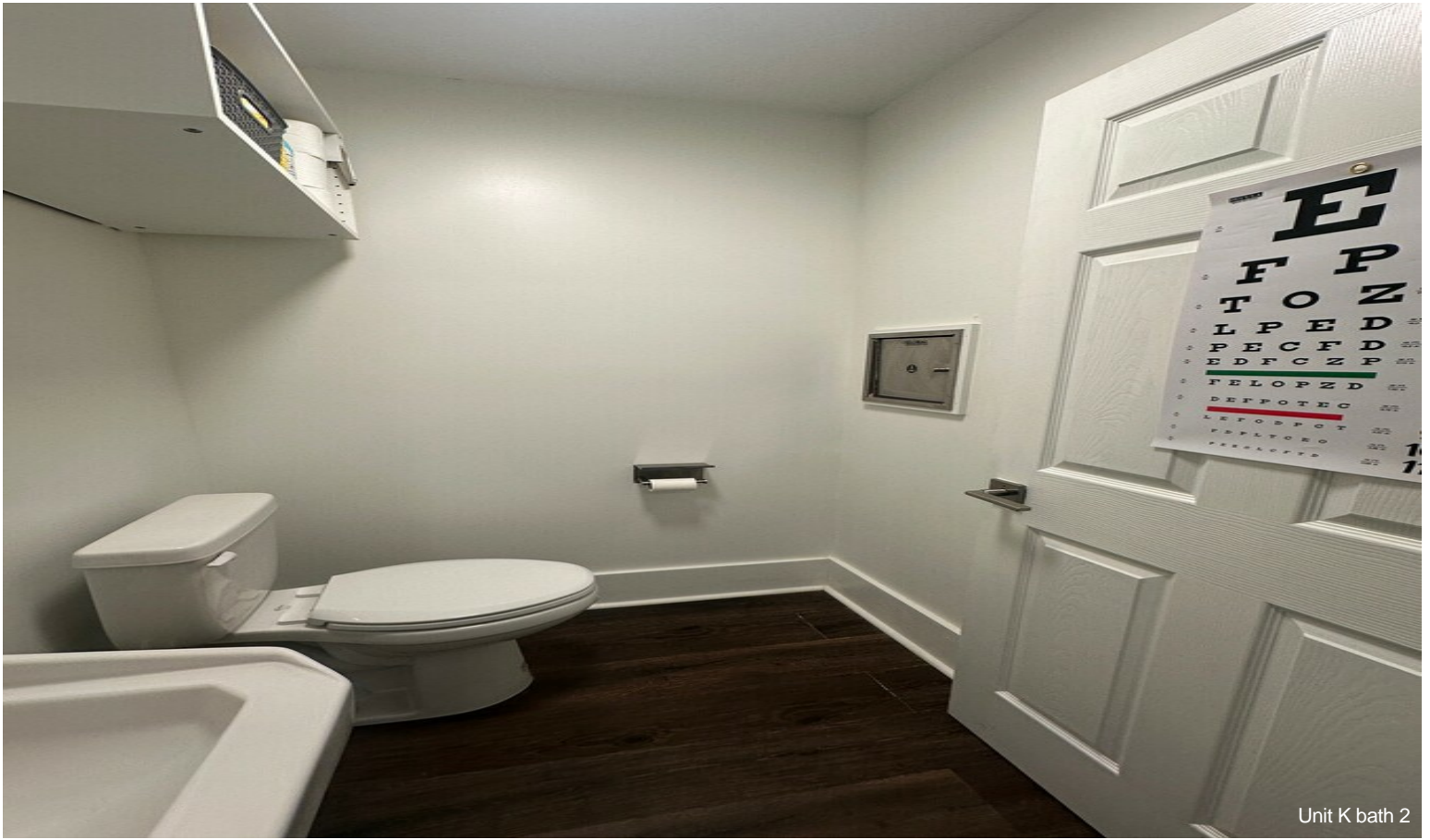
Unit K bath 2