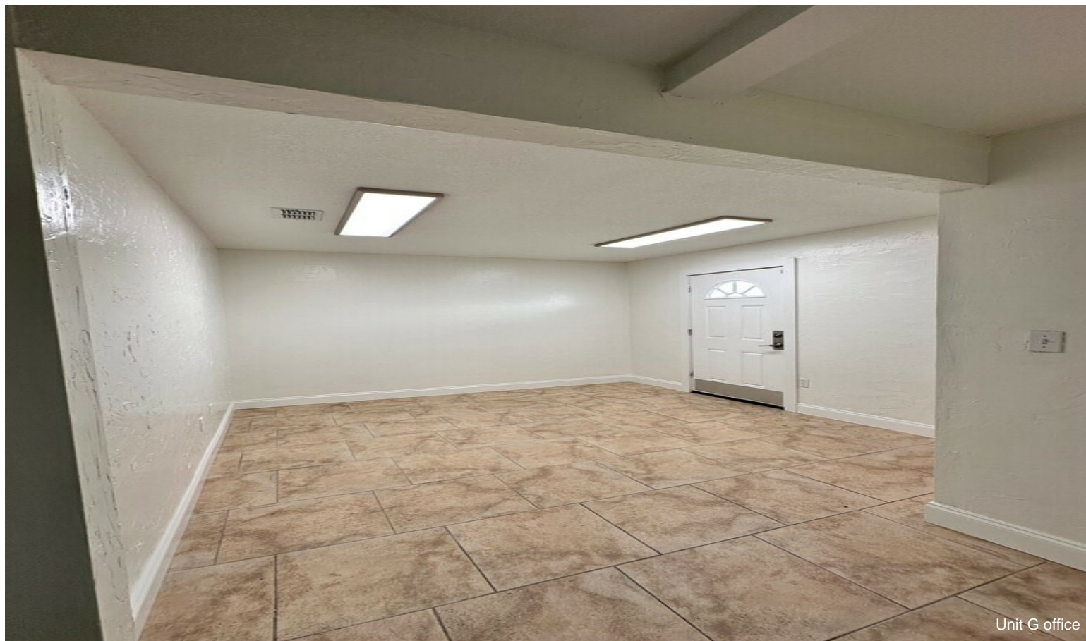
Unit G office