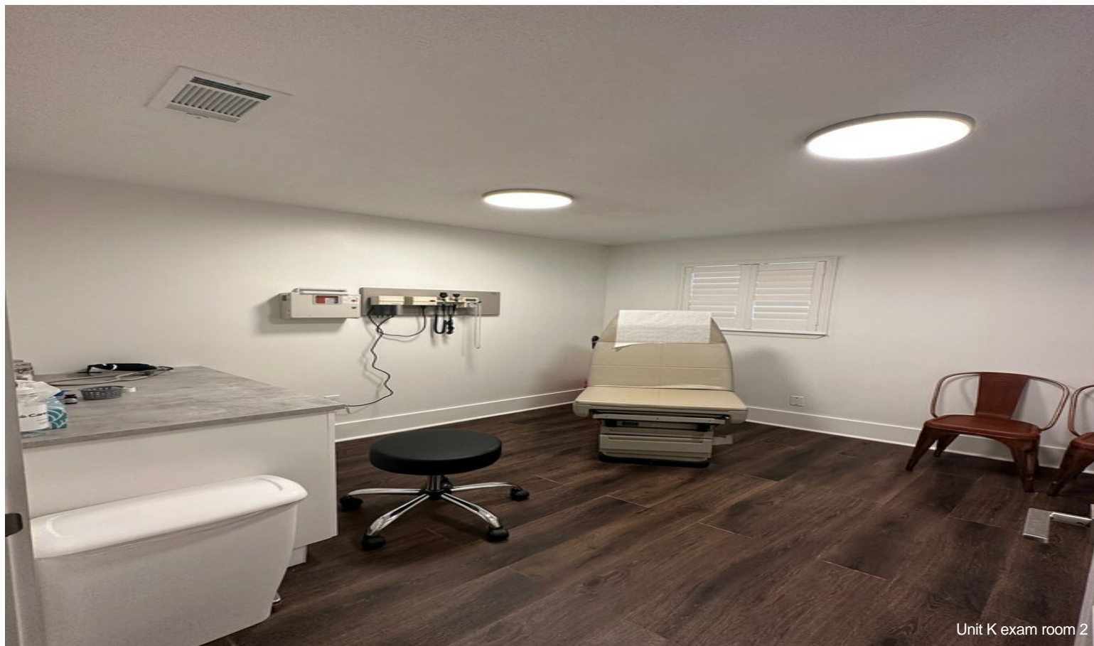
Unit K exam room 2