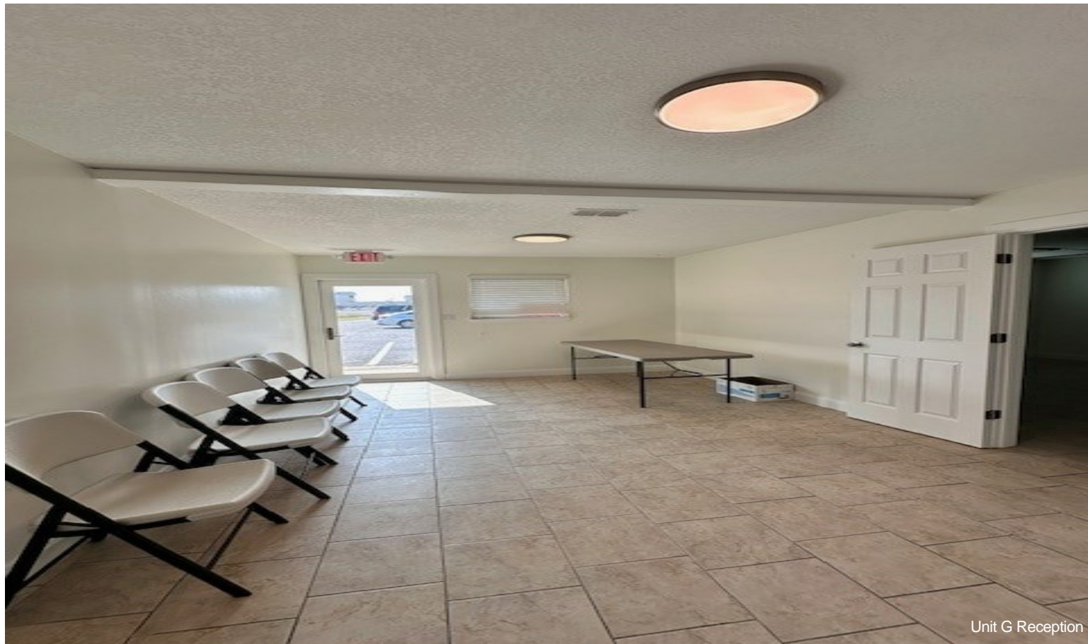
Unit G Reception