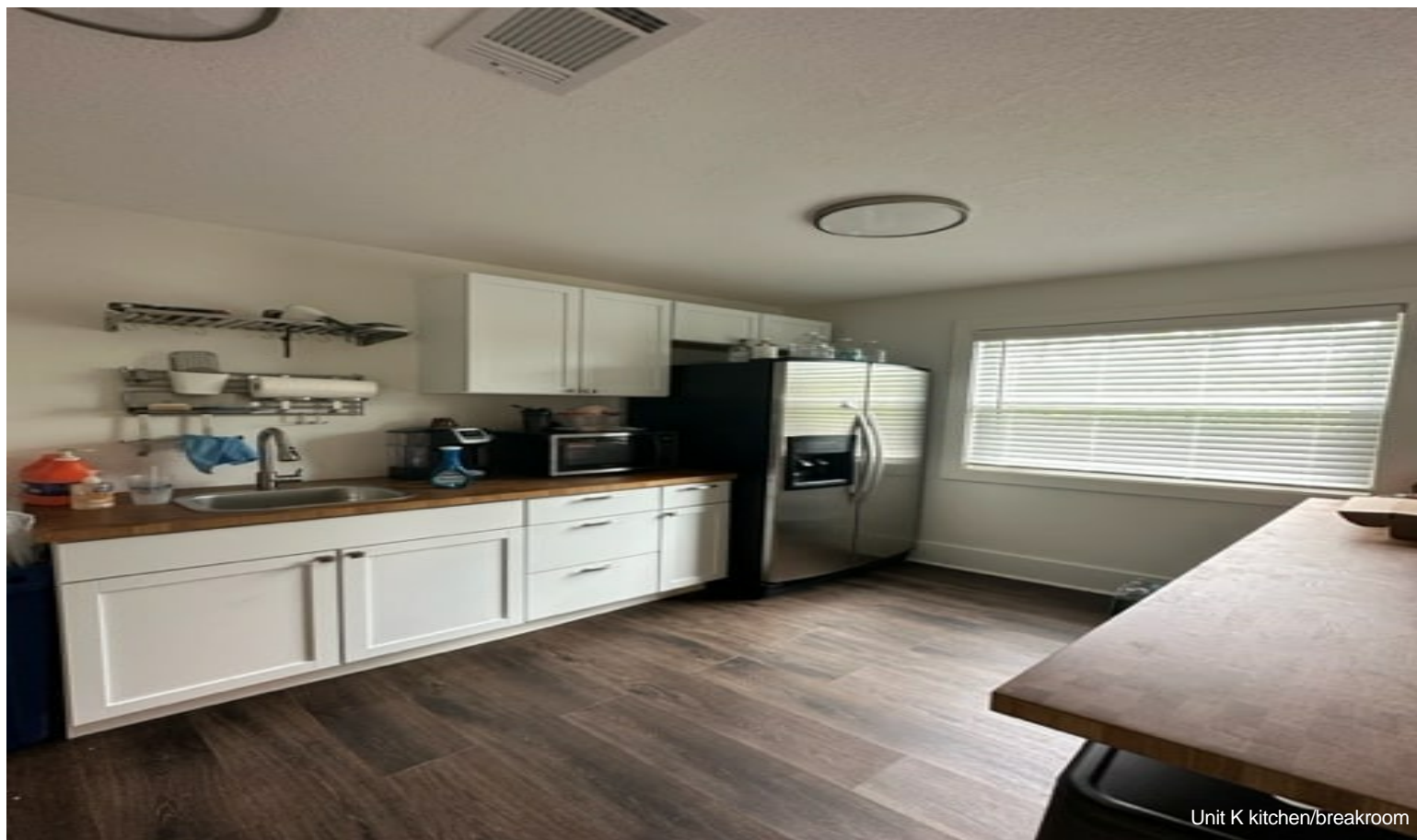
Unit K kitchen/breakroom